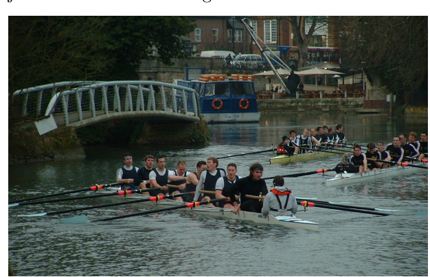
The Men's 1st Torpid, after rowing over on Thursday.

The Men's 2nd Torpid actually had fewer novices than the 1st Torpid but hadn't rowed together as an eight until the previous week (the question 'Why?' springs to mind). They got a consolation bump on the last day which cheered them up a bit, but with just a little more training . . .