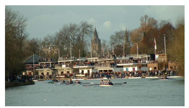
Racing on the Saturday of Torpids. The first time the full scale Torpids — 11 divisions, 4 days — has been run since 1997.

So, it was one of those Torpids. A net loss of 22 places by our crews was 'bettered' (?) only by Oriel (-25) and Brasenose (-33), which also happened to be the only two colleges that any of our crews managed to bump. Not that these things seemed to affect the atmosphere at the Rowing Society Dinner, at which our President was last seen brandishing an original Baker Pot. 35 years ago our Torpids also went down but, if the evidence of the Alumni News section is anything to go by, the rowers still seem to be on speaking terms. And if you're any good at crosswords, there's an important job waiting for you . . .