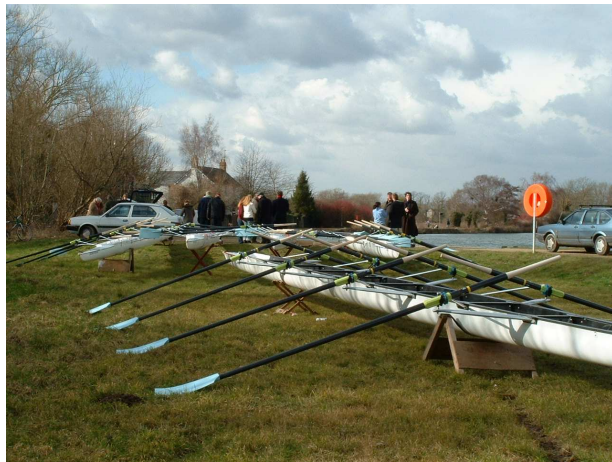
Preparations for the official launch of the new fleet. Finally got hold of enough trestles, although the men's boat had to be christened on the water.

As it turned out, the women's 1st Torpid actually raced in Catz Me if You Can and the men's 2nd Torpid Tony Hancox — the boats that they had been training in for most of the term. And, yes, they all came through the event in one piece.