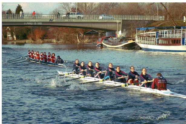
The Women's 1st Torpid closing on Merton on Thursday.