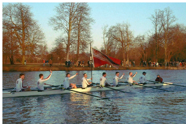
The Men's 1st Torpid taking the Boat Club flag for an airing after racing on Saturday.

A good night was had by all at the Rowing Society dinner. Blades for the men's 1st Torpid are being painted and chalked up as you read this. Very well done to all crews, and looking forward to Eights.