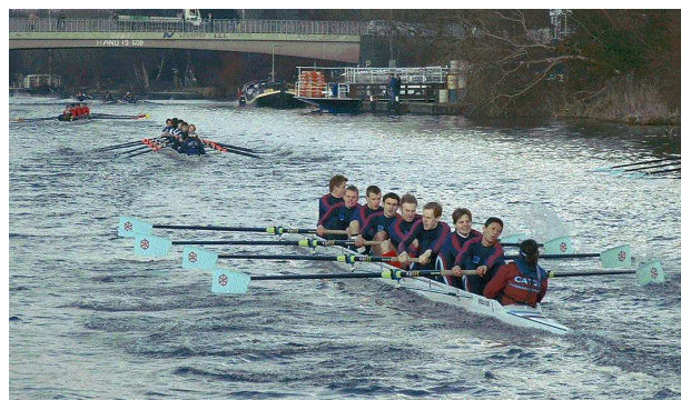
The Men's 2nd Torpid in pursuit of Queen's II on Friday.