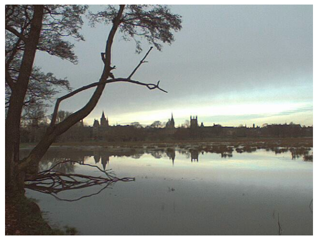
The view across a flooded Christ Church meadow. A few more inches, maybe some buoys, and I think we'll have ourselves an alternative rowing venue.

There are recollections of events of 40 years ago (which the more delicate reader may wish to avoid) and news from alumni of that period, while a contemporary, Leslie Singleton, has been piecing together some old programmes.