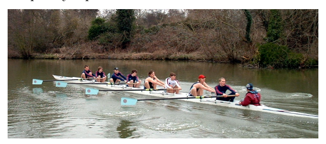
The Men's 1st Torpid racing in the Isis Winter League.

Another term, another frustrating state of affairs with the state of the river in Oxford. It was with great disappointment we bore witness to the cancellation of each successive day of Torpids before our boats could reach the bung lines. Thus the headship for the girls will have to wait for one more year, while the men's rapid rise through Division I also took a temporary reprieve.