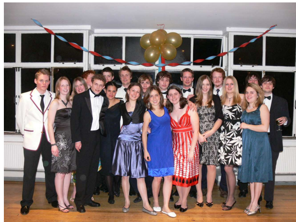
...and, later that day, taking a break from training to attend the London Party.

events to keep our alumni network in contact. Alumni events planned for this summer include dinner on an old college barge, a Pimms party on the Saturday of Eights in a marquee and possibly even a croquet tournament too!