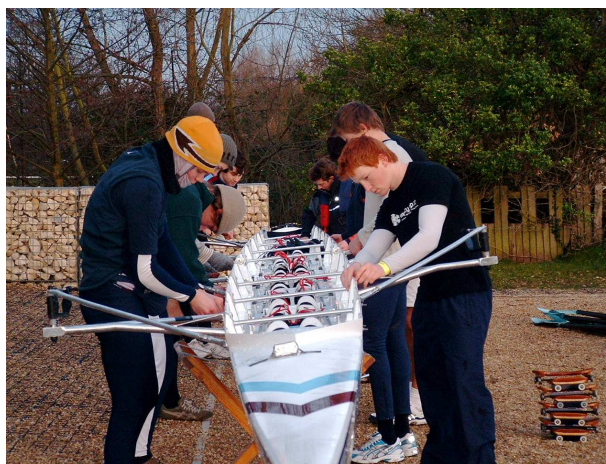
Things to do while the river is closed (2) Catz men derigging their boat prior to the London training weekend.