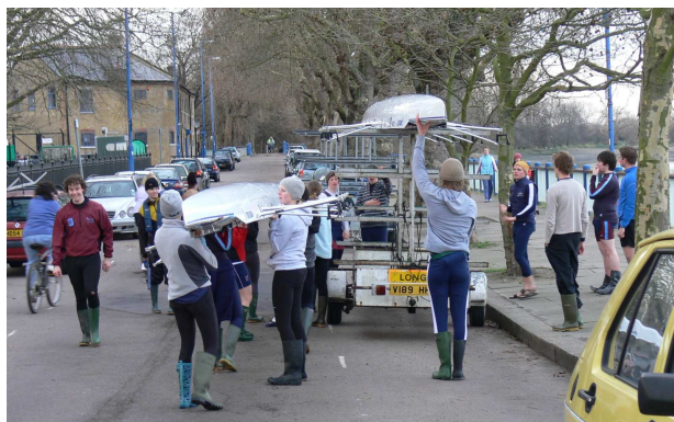
Catz crews unloading the trailer on Putney Embankment at the start of the weekend's training on the Tideway ...