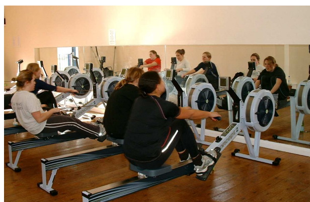
Things to do while the river is closed (1) Catz women training in the boathouse erg room.

Anyway, let's hope they finally see sense and decide to firmly nail Torpids into 7th week in future. We can claim it's to maximise the water time for training, but really it's so we can organise our Rowing Society Dinners without the confusion we had this year.