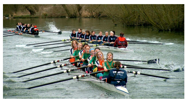
The Women's 3rd Torpid (centre) in the thick of it on the Saturday . . . .

Term began well with many girls from both the first and second boats attending a training camp in 0th week. It was great to have 12 girls competing for seats in the 1st VIII. Crews were finally decided and, for the first time in a long while [1996], Catz women had 3 boats set to enter Torpids. Unfortunately, though, the onset of snow meant we were forced to turn to ergs, circuits, weights and more ergs along with some giant snowman building. Despite the weather and limited water time one Isis Winter League race went ahead which all three crews took advantage of. The 2nd and 3rd VIIIs recorded some respectable times whilst the 1st VIII continued their winning streak! With the flag continuing to limit training and Torpids less than two weeks away the 1st VIII went to a completely deserted Dorney Lake for a hard but successful day of training. We all had to make the most of the water time on the Isis with the flag only dropping to Amber less than a week before Torpids. Despite this both the 2nd and 3rd VIIIs set some