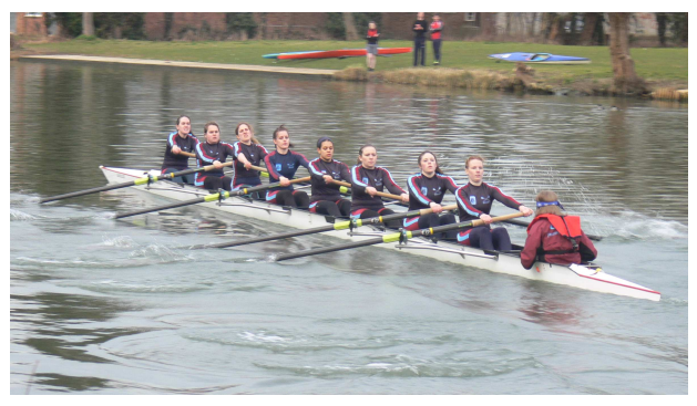
... while the Women's 1st Torpid had a slightly more relaxed time rowing over Head of Div I each day.

With Torpids over we're now focusing on training for Summer Eights and the chance to finally bump some crews and the possibility of more blades! I'm expecting the women to be entering three VIIIs and we very much hope to build on the successes that we enjoyed this term!