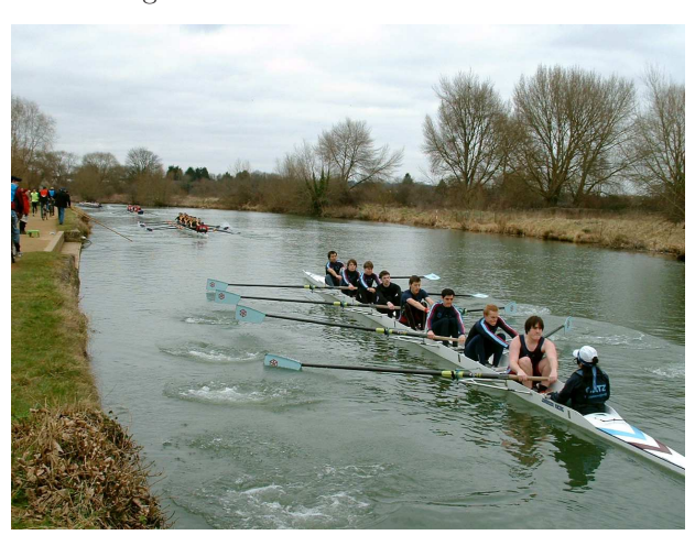
The Men's 2nd Torpid starting on the Saturday.

The 2nd boat, being the top of Div 6, were tasked with reclaiming Catz' position in the fixed divisions above. On the first day they were able to outpace the Magdalen crew behind them, but unfortunately were hit with a case of the crabs in the second race so failed to catch Regent's. Spurred on by the thought of having to row twice three days running (and feeling fresher after their first race was klaxoned midway through) M2 proceeded to overbump Linacre on Thursday, followed by Hertford on Friday, after being bumped by a rapid Wolfson crew, and finally overbumping St Benet's and Brasenose after some mid-Gut carnage!