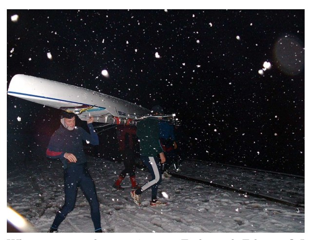
What were you doing at 7am on Friday, 6th Feb 2009? I bet you weren't having as much fun as this.