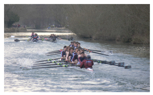
Men's 1st Torpid closing for the bump on the Thursday