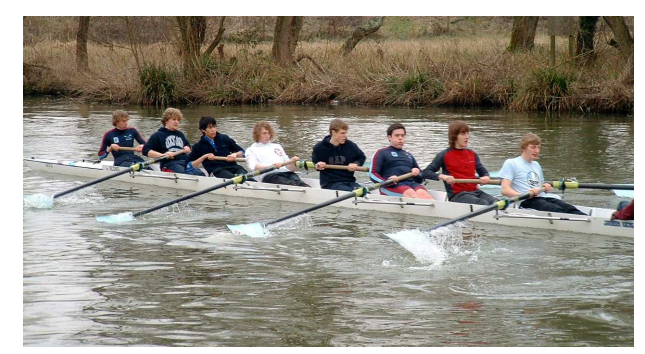
Finally out on the water, the Men's 2nd VIII on the Isis yesterday. Only 24 more training-days to Torpids...

For those who have scanned the menu in detail, I am assured that the dessert is actually a 'Mousse' and not a 'Mouse'. Having recently returned from a gastronomically adventurous week in France, I can't help feeling a bit disappointed.