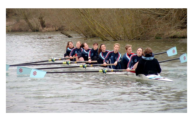
The Catz Women's VIII racing in today's IWL.