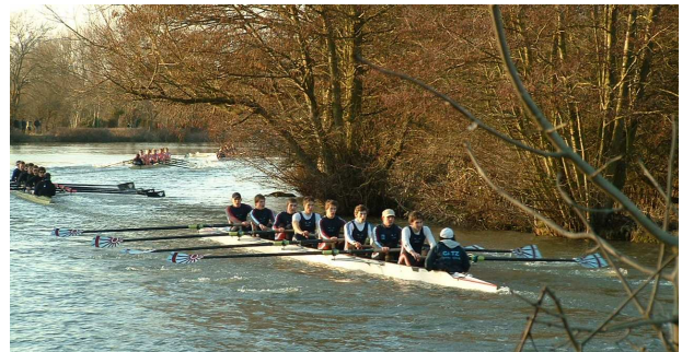
The Men's 1st Torpid racing on the Saturday.

Rowing On arrived, with an ominously fast river. The thirds, to whom I will be forever apologetic for a lack of outings, put up a brave effort but didn't qualify. Obviously, the weather Gods were furious with this result, raining their fury over Oxford all of Saturday, putting racing at jeopardy. As a result, the first day's racing was done in half divisions, and the second allowed all fixed division boats except the lower half of Div 5 (housing M2) to race. We didn't get to join the fun until Friday.