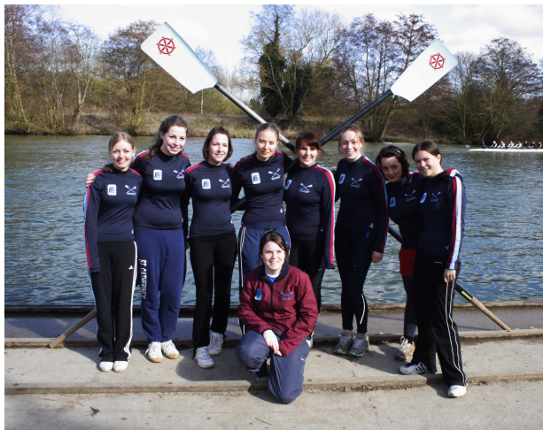
The Women's 2nd Torpid after racing.

Finally, best wishes are sent to the Third years sitting their exams next term.