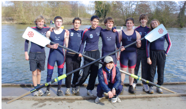
The Men's 2nd Torpid after racing.

down one, the crew should be immensely proud of their efforts. Even holding a spot in the upper half of Div 1 takes a tremendous amount of work, and for their dedication, I am proud.