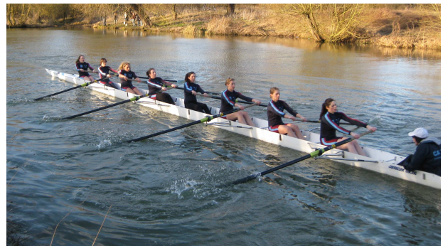
The Women's 1st Torpid racing on the Saturday.

Heavy rainfall occurred the weekend before Torpids which resulted in Torpids being run under Red and Amber flags. The women were lucky to have Jack Plummer offer to cox them for each of the four days of racing. The women's 1st Torpid were fortunate to be able to race the full four days, but the 2nd boat were only able to race on the Friday and Saturday.