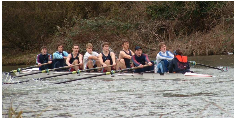
The Men's 1st VIII racing in IWL-D.

There's also news of our OUBC triallist, whom I seem to have completely overlooked in the last newsletter.