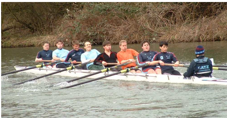
The Men's 2nd VIII racing in IWL-D.

However, with a couple of IWL events on the Isis, there's been plenty to keep people interested. With some crews doubling-, or even tripling-up, but other crews (usually those training off the Isis) not competing, as a rough guide you'd expect crews to finish somewhere around their Torpids position on the river. Incidentally you can find video and more photos of the Catz crews racing on the RS web-site.