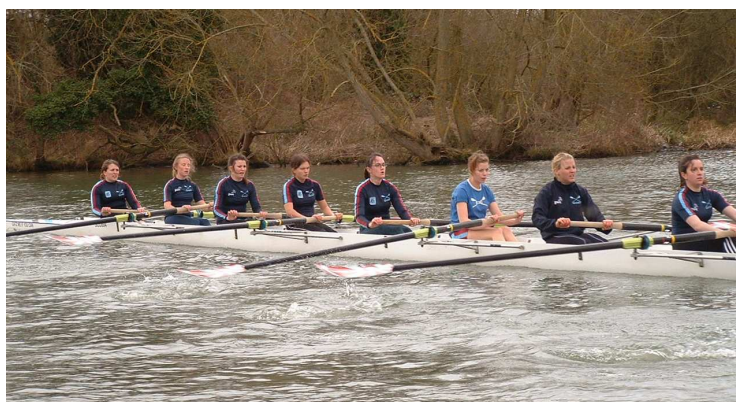
The Women's 1st VIII racing in IWL-D.

For those who can't I hope to be e-mailing out the usual evening round-ups and putting up photos on the RS web-page. You might also like to keep an eye on the OURCs 'live-bumps' service.