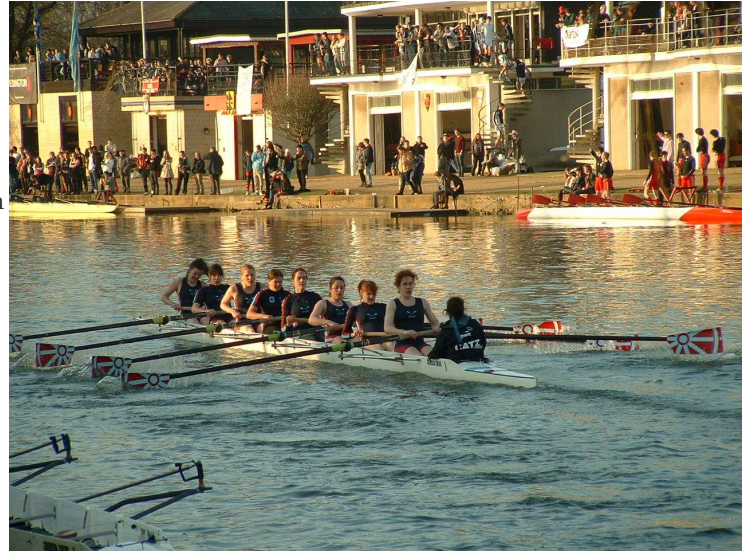
The Women's 1st Torpid rowing over on the Friday.

eryone remained positive but there was growing concern about what could be achieved over the short time we had remaining. After agonising for many weeks over whether entering Torpids was a sensible choice, a unanimous call that we should represent the College whatever happens was made.