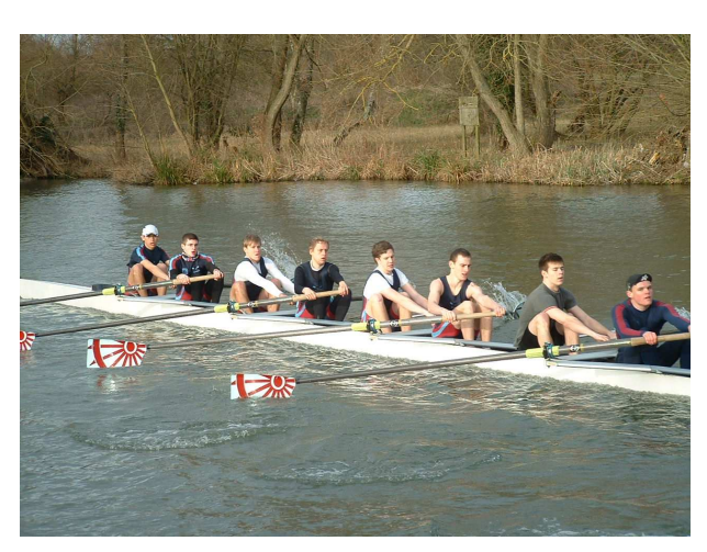
The Men's 1st VIII, rowing as Catz C, in the IWL C.