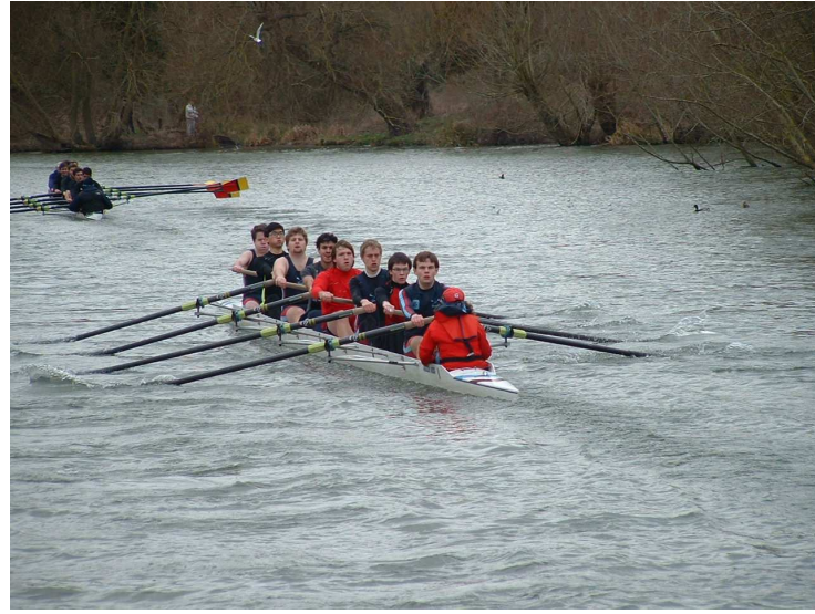
The Men's 2nd VIII rowing in the IWL C.

The women are chasing Wadham and being chased Oriel. Wadham were faster than Catz in IWL B and Oriel slower in IWL C so it could be a quiet first day, just to settle the nerves. Magdalen start Head but they haven't raced since IWL A when they were 2 seconds slower than Catz, and S.E.H. who start 2nd, don't seem to have raced at all. Perhaps it's going to be Wadham's year.