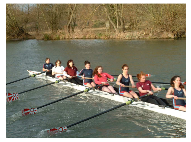
The Women's 1st VIII rowing in the IWL C.

They've been using it since the start of term and, by all accounts, are delighted with it but the cox will be even happier once we fit a rudder designed for steering round corners rather than keeping the boat straight down a 2000 m course. At some point we hope to have an official naming ceremony but first we'll need a name — we await the Boat Club's decision on that.