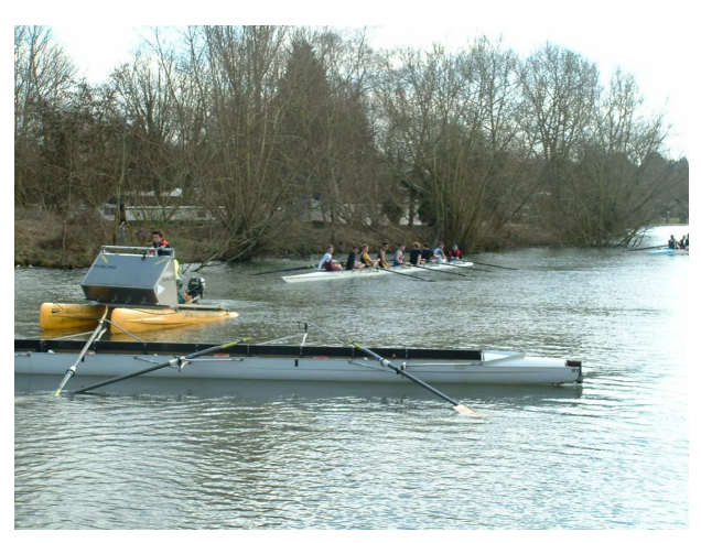
Pieces of Eight? It may not have been a good Torpids for some of our crews, but at least all our boats came back in one piece.

Men's IV* 2:55.5 7th/37 Qualified Men's III 3:09.0 21st/37 Failed Women's II 3:38.5 18th/34 Failed * Redesignated Men's III in Torpids