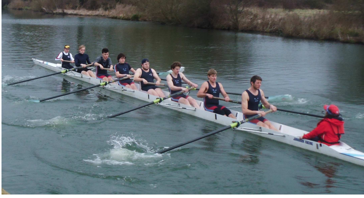
The Men's 3rd Torpid racing on the Thursday.

Despite the disappointment for the first boat, we still have many successes to celebrate. The second