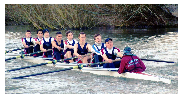
The Men's 1st Torpid racing on the Thursday.