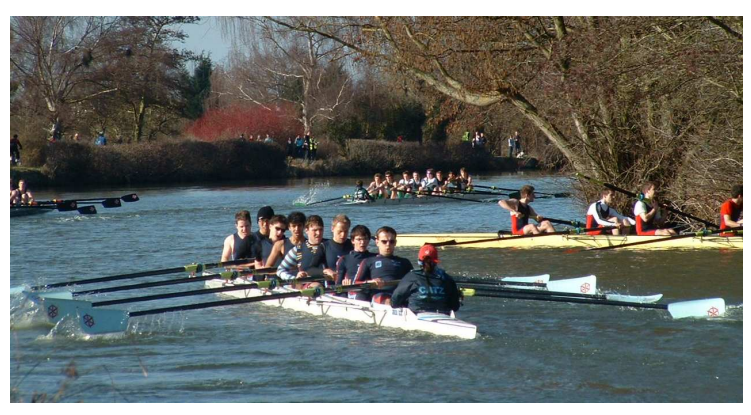
The Men's 2nd Torpid racing on the Saturday.

since 1998 that we have had a men's third boat qualify for Torpids, and they have set a good standard to act as a target and to be built on for next year.