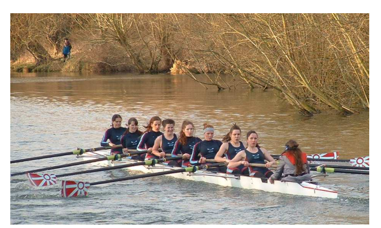
The women's 1st Torpid racing on the Thursday.