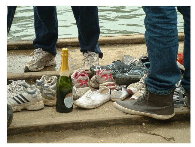
It looks like somebody's expecting a happy landing.