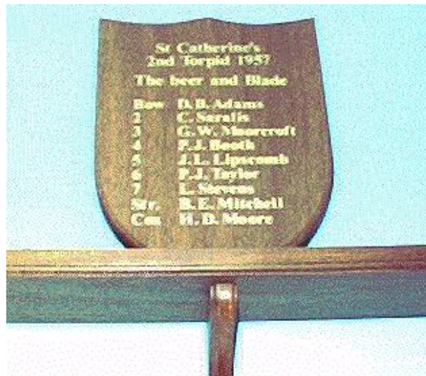
The '57 2nd Torpid, the original 'Beer & Blades' crew.

crews. These cost £90 each (i.e., £10 a person) so if you would like your crew commemorated it might be a good time to start phoning around anyone you're still in contact with and see if they'll pay up. We are hoping to unveil the first batch on the Saturday of Eights, 2003.