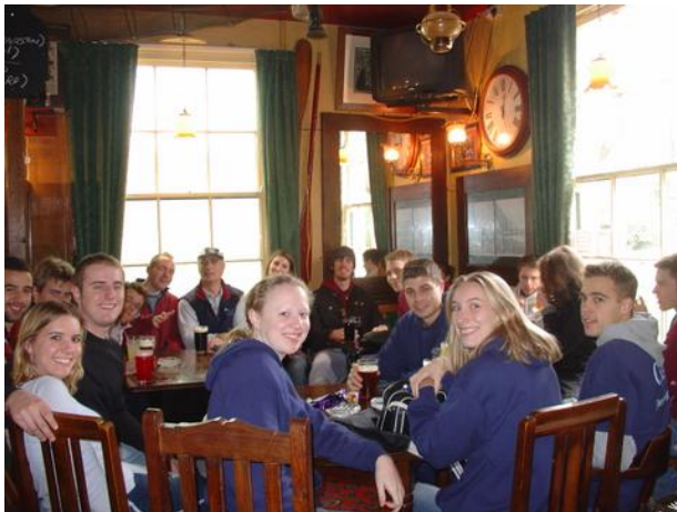
All's well that ends in the pub. Catz crews and coaches relaxing in the Isis Tavern at the end of Christ Church Regatta.