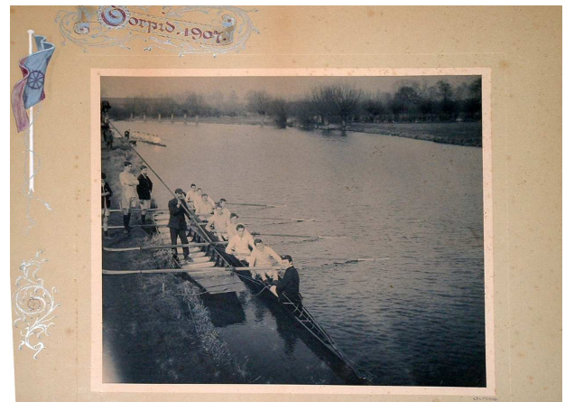
Right hand photo, at the Start, near Haystacks Corner.