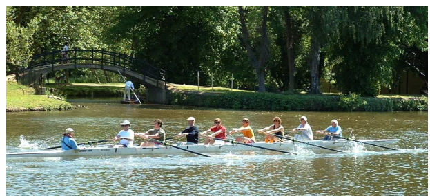
Some of the Forty-Niners, and their friends and relations.

On the Sunday morning some of them rowed an eight in order to celebrate the 60th anniversary of the record year of 1949 when all three eights recorded six bumps — something we believe has never been done before and cannot be achieved again because of the reduction of Eights 'week' from six days to four.