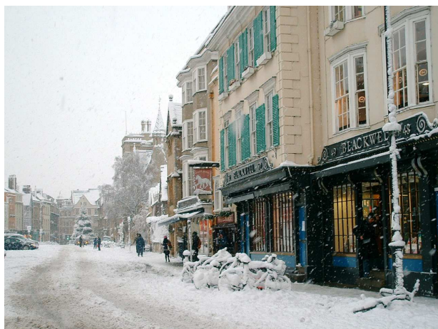
A wintry welcome for those returning to Oxford in 2010. (Broad St, 6th January).