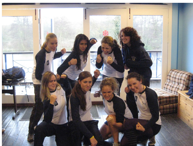
Catz Novice Women, attempting to 'strike a pose' (with, it has to be said, varying degrees of sincerity).