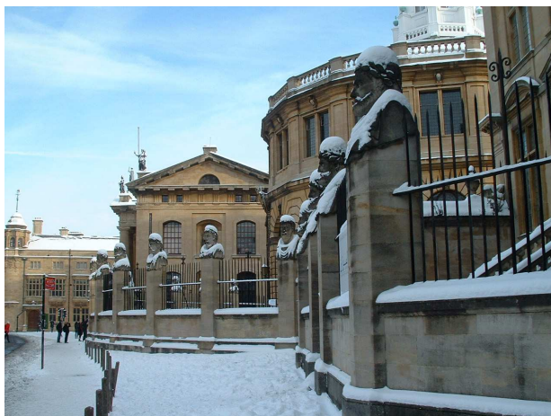
The snow finally arrived in Oxford this weekend. Fortunately, well after the term's rowing had finished.