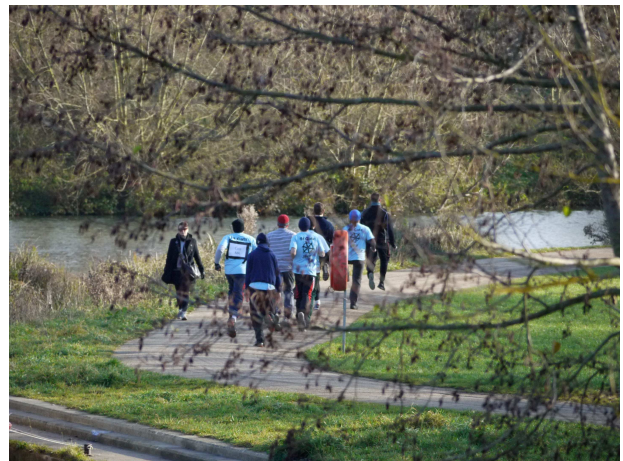
March or Die! Catz Men's Novice A, aka the 'Foreign Legion', heading off on a warm-up run before their first race in Christ Church Regatta.