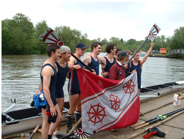
The 2006 Men's 1st Eight. With 7 different nationalities in the crew, they decided to settle for displaying the Boat Club flag.

Now I must try and pass my finals in 2 weeks time!