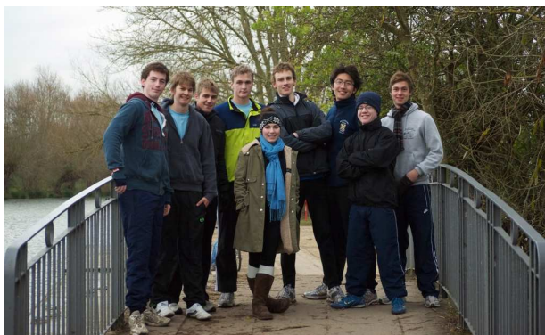
Catz Men's Novice B ('Torpedo').

In Christ Church we entered two boats, Foreign Legion (mainly graduate rowers) and Torpedo, two fantastic crews both showing dedication in the training leading up to the races. Unfortunately F.L did not make it past the repechage, being beaten by Brasenose. Torpedo got through to the second round beating Green Templeton, but their journey ended there being beaten by Queens.