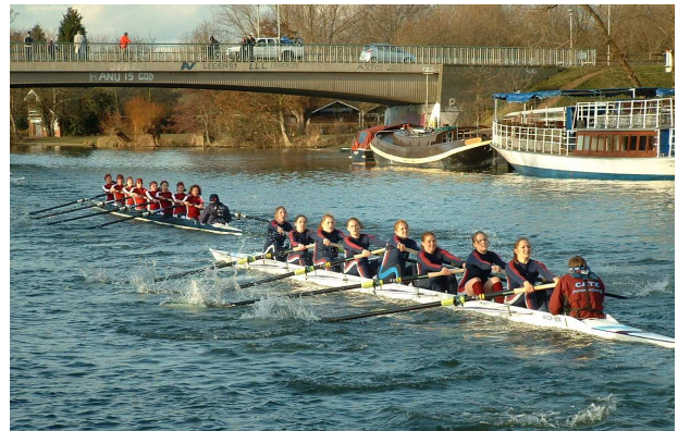
The 2006 Women's 1st Torpid closing for a bump on Merton on the Thursday.

The new Captains had an ordeal by fire, literally, as Catz' entire fleet of eights was destroyed by arsonists over the summer of 2005. Nevertheless, by Torpids, the Boat Club was definitely back on its feet with the men gaining blades and finishing 6th on the river, while the women rose 5 to finish 3rd but missed out on blades by rowing over on the last day. While the women's progress in Eights was more modest, the men were reinforced by 2 Blues, 2 Isis, and an Olympic gold-medallist so, to no one's great surprise, won blades again. The following extracts are from the newsletters.