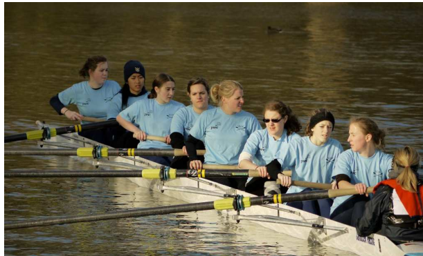
Catz Women's Novice B, having just won their first race in Christ Church Regatta.

dubbed 'Carnage', beat the St Peter's B team, whilst the Novice A's beat the Queen's A by a convincing length. Both teams had byes in the second round so enjoyed a well earned second day off. On the third day the Novice B's narrowly lost the the University A team, but the Novices A's managed to beat a strong Keble A team. Progressing to the fourth round the A's lost by just a 1/4 length to the Pembroke A's. We're very proud of their achievement.