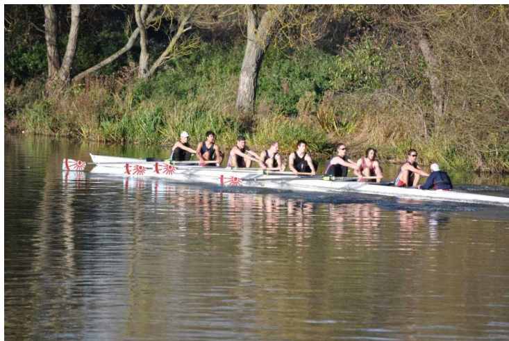
St Catherine's racing in the Isis Winter League A

find opportunities for many water outings, but still managed to win IWL A with a few last minute subs. Most of our training has been focused on our conditioning, working with ergs and weights to build up a foundation for the rest of the year. The guys have approached this with great spirit, and have made some fantastic progress over the term. We look forward to bolstering our numbers with the novices, fulfilling our potential, and doing some damage come Hilary and Torpids.