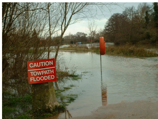
Rain stops play: the view from the Gut, with helpful clarification provided by the local authority.

Finally, having spent far too much time of late sitting in front of my computer rather than out sculling, I've been pondering how to assess quantitatively where we currently stand in the grand scheme of Oxford college rowing.