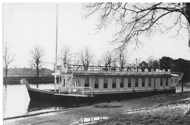
For sale — a genuine College Barge. One careful owner, plus St Catz Boat Club.

A couple of weeks ago on BBC2 there was a programme recreating the original performance of Handel’s Water Music when, in 1717, King George I floated down the Thames to some specially-written musical accompaniment. The boat used for the programme was, in fact, the last St Catherine’s Barge, which had been restored, externally at least, in period style at Turk’s Boatyard in Sunbury on Thames. I believe that the barge is up for sale again (but, trust me, you can’t afford it).