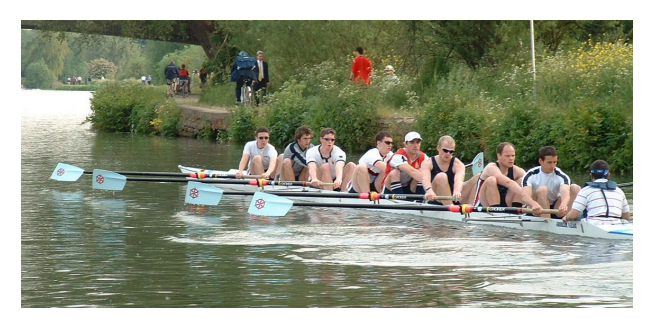
The Men's 1st Eight warming up on Thursday (no, that's just the way the boat's rigged!).