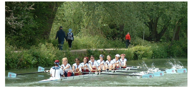
The Women's 2nd Eight who gained two places making them not only Catz most successful crew of the week but the most successful crew of the past two years.