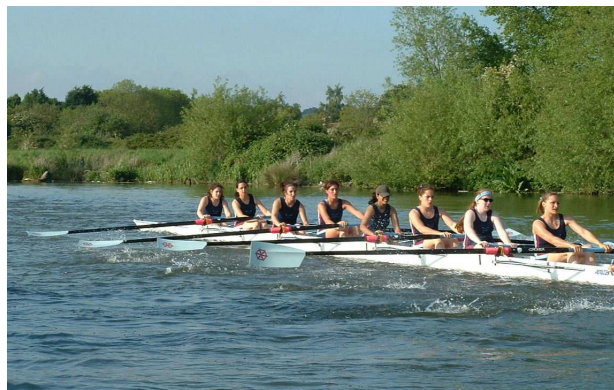
The Women's 1st Eight racing on Thursday.

This term was not as successful as last term in terms of bumps, but we recruited a larger squad of keen rowers who, together with next years intake, should do well in Torpids 2006.