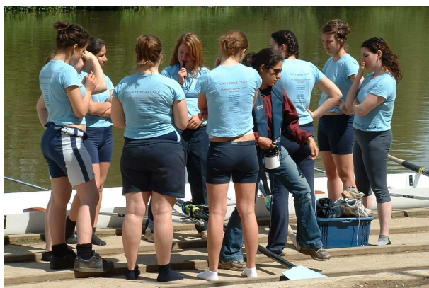
The Women's 2nd Eight