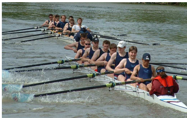
The Men's 2nd Eight, closing on Univ II on Friday, but Univ were to catch SEH II first.

Summer VIIIs went very well, with the Beer VIII qualifying and adding a considerable atmosphere to the boathouse, M2 bumping 3 out of four days, very narrowly missing out on blades on the Friday due to the two boats ahead of them bumping out at the top of the division, leaving them without anyone even to overbump. They produced a hugely impressive crew speed given the diversity of rowers in the boat and the quality bodes well for next year.