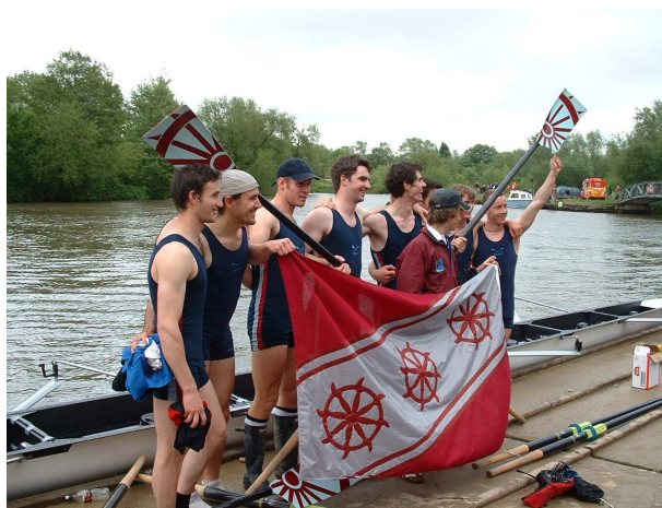
The Men's 1st Eight. With 7 different nationalities in the crew, they decided to settle for displaying the Boat Club Flag.

M1 were a little more difficult. With two Blues, the Isis stroke and cox, a Harvard Varsity oarsman an Olympic lightweight gold medallist all becoming available to row for Catz this term, it was set to be interesting. But with crew members disappearing to Denmark, Germany, France and Croatia, and technical problems with the boat (which had to be returned to Sims for fixing) we only got about 4 outings in before the first day of Eights.