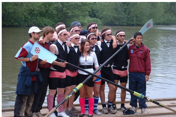
The Men's 3rd Eight, attempting to bring a touch of class to the otherwise vulgar brawl that is Men's Div VII.

The next big fixture was Bedford Regatta, in which Catz men entered two competitions with M1, a novice VIII and a IV. It was excellent race experience for all concerned despite not winning anything.