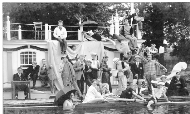
The St Catherine's Boat Club and Barge in 1957.