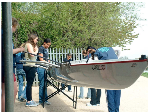
The Women's 1st Eight adjusting the rig on their boat, the Alan Bullock .