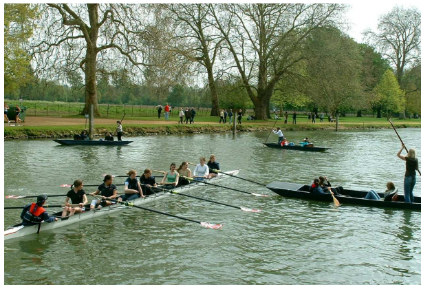
There's no escaping the traffic chaos of a Bank Holiday Weekend.