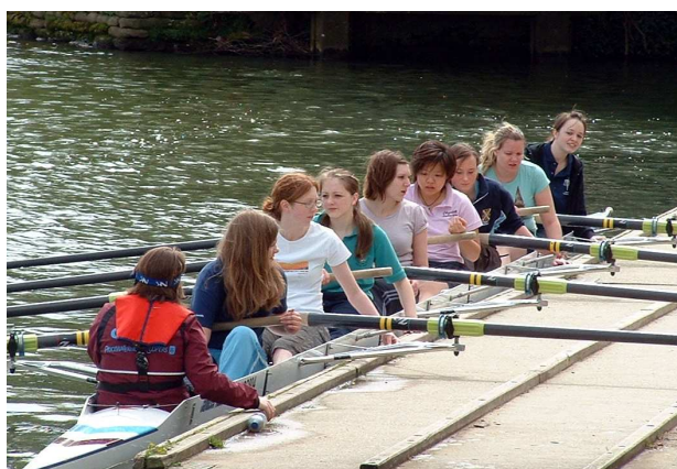
The Women's 3rd Eight who prefer to style themselves the Cocktail VIII because it sounds more sophisticated than Beer VIII (even though the intentions are the same).

The Women's Boat Club has rapidly distilled itself into 3 crews, the 1st Eight largely resembling the Torpids Headship crew and they'll be racing at Bedford Regatta on 10th May.