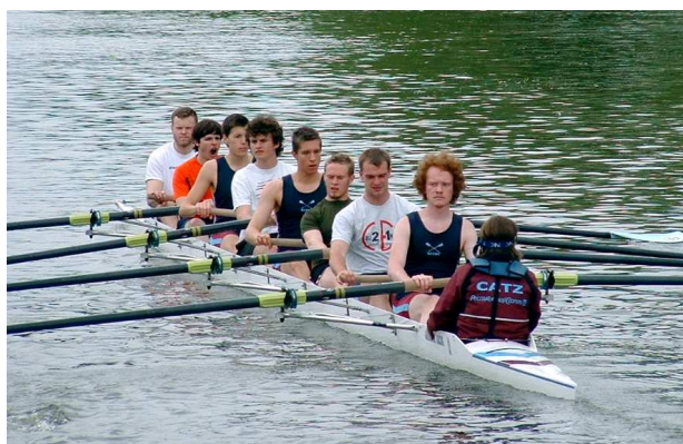
The Men's 2nd Eight in one of their many variations.