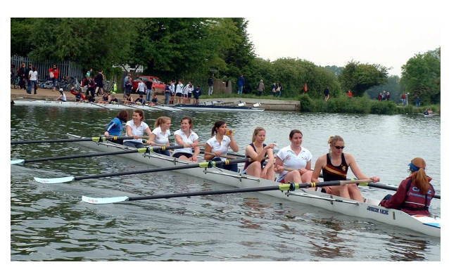
The women's 2nd Eight after bumping on the Friday.