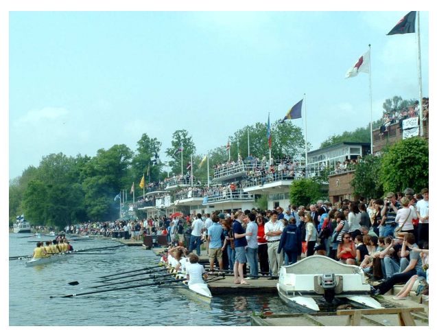
The boathouses on the Saturday of Eights.