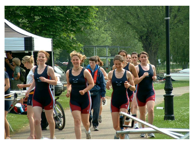
The women's 1st Eight warming up at Bedford Regatta.