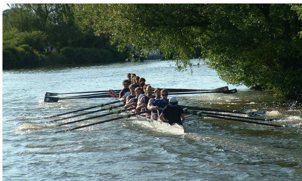
The Men's 1st Eight closing for the bump on Magdalen on the Friday.

This, however, was nothing compared to the mighty Firsts. Hertford bumped out ahead of them on day one, leaving them only a day's immunity against Wolfson. Yet they caught Teddy Hall on the Thursday sooner than Hertford did. Arch-rivals Magdalen were next up, and the crew took immense pleasure in righting a history of near-misses, sending them to face inevitable spoons. Saturday brought a bump against Balliol, yet again faster than Hertford managed. Up three to sixth on the river, the crew finally got the result they deserved.