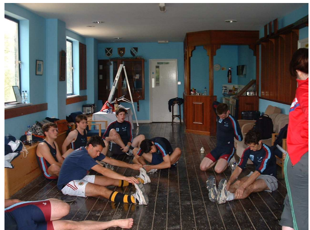
The Men's 2nd Eight stretching in the boathouse before their first race.

As per usual, M3 and M4 had to qualify for Eights. Sadly, luck was not on our side, as M4 lost a rower due to a prolific de-seating, and the thirds missed out on qualifying by five seconds because of two very large crabs. I am sure both crews enjoyed the experience, and hopefully they'll be back at the start of next year, keen to continue.