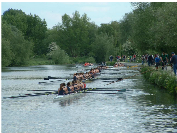
Catz leading off Women's Div II on the Thursday.

Although the results weren't as we hoped they would be, all of the women have put in an enormous amount of effort this term, and we have all improved greatly. I hope everyone has had a very enjoyable term and thank you again to everyone for helping me out during many panicked moments!