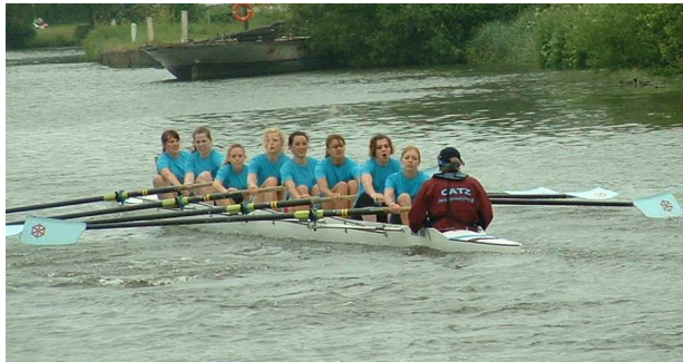
The Women's 2nd Eight in their more normal 'rowing over' mode on the Saturday.

to be over a lot sooner! The 2nd Eight did extremely well, holding their position for the first two days. After being bumped on the third day, the crew were keen to take their revenge and only missed by a tiny amount.