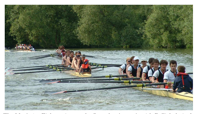
The Men's 1st Eight racing on the Saturday (centre), with Balliol closing!

After a solid Torpids performance from all men's crews, there was a lot pressure and high expectations building up towards Summer Eights. A fair number of us were back before the start of term for extra water and land training to make sure that we hit the ground running. The weather was great, the Isis was nice and quiet, and thanks to a camera attached by Hugh we could watch back over some of the outings. A promising start to the term.