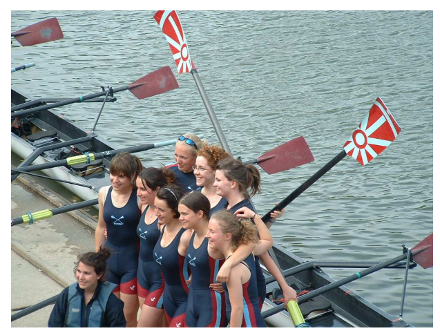
When all's said and done ...

28 Aug-4 Sep 2011World Rowing Championships22-25 Feb 2012Torpids (tbc)23-26 May 2012Eights