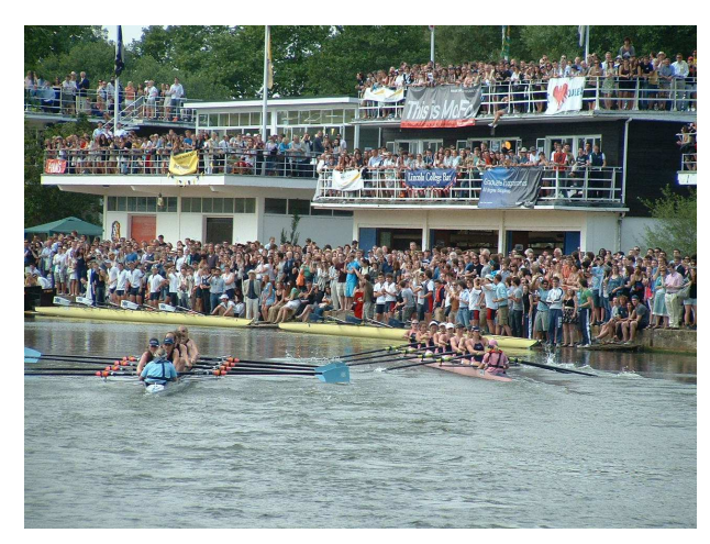
Some interesting steering in W.Div I as Wadham pursue Pembroke and somehow fail to bump them, or indeed any of the M.Div I boats already set out on the rafts.