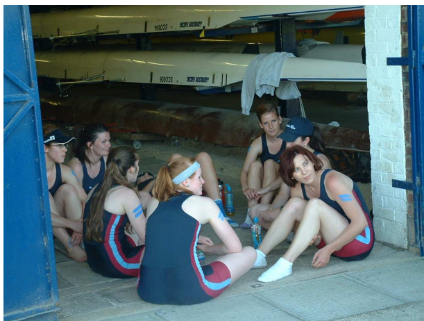
The Women's 1st Eight finding some shade before boating for their last race. I finally worked out the significance of two stripes on the arms ...