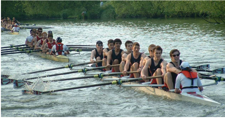
The Men's 1st Eight chasing Hertford on the Thursday