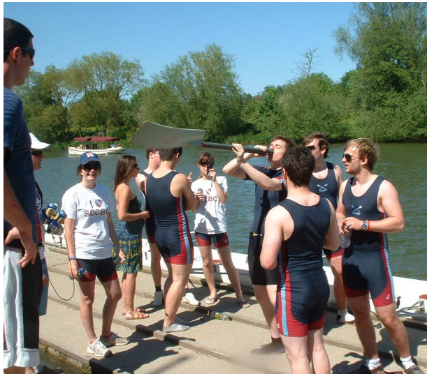
The Men's 2nd Eight 'relaxing' after their last race