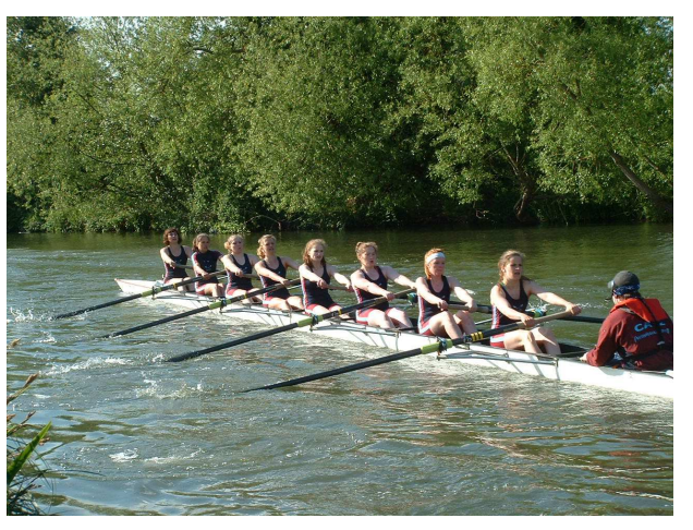
The Women's 1st Eight racing on Thursday.

Following the success of Torpids, the women of SC-CBC had a well-deserved moment of rest, luxuriating in our bumps and blades. Not wanting to be away from training for too long however, we soon returned to the grind for the Easter vacation. With our Torpids-high to give a sweeter edge to solo efforts, the women were ready to tackle the next challenge of Summer Eights.