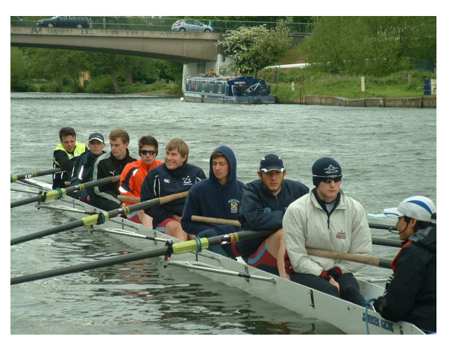
'Tell me again: what was the attraction of racing in Summer Eights?' Catz Men's 2nd Eight keeping warm before Friday's start.