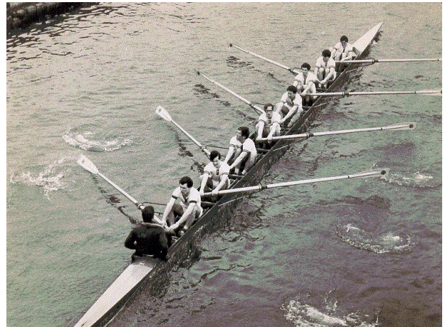
The 1965 1st Torpid, viewed from Donnington Bridge.

in a private annual battle, while the trio of Keble, Christ Church and St Edmund Hall fought it out at the top of Div. 1