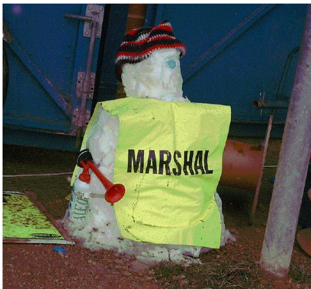
During a particularly wintry Torpids, several race officials required a little thawing out at the end of their duties.