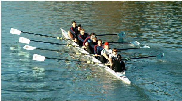
Possible variations the Men's (above) and Women's (below) 1st Torpids in training over the weekend.