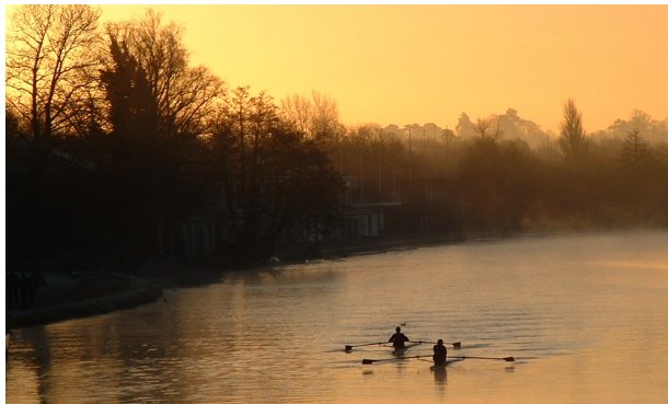
A couple of scullers getting in an early start in an attempt to avoid the Saturday morning crowds.

Mal Spencer and Alex Zdravkovic both attended the Lightweights' January training camp in the south of France. They currently have a squad of 20 rowers but, with Cambridge looking unlikely to field a 'lightweight reserve boat' for this year's Nephthys-Granta race, no one's quite sure whether the Oxford Lightweights will end up selecting one or two boats.