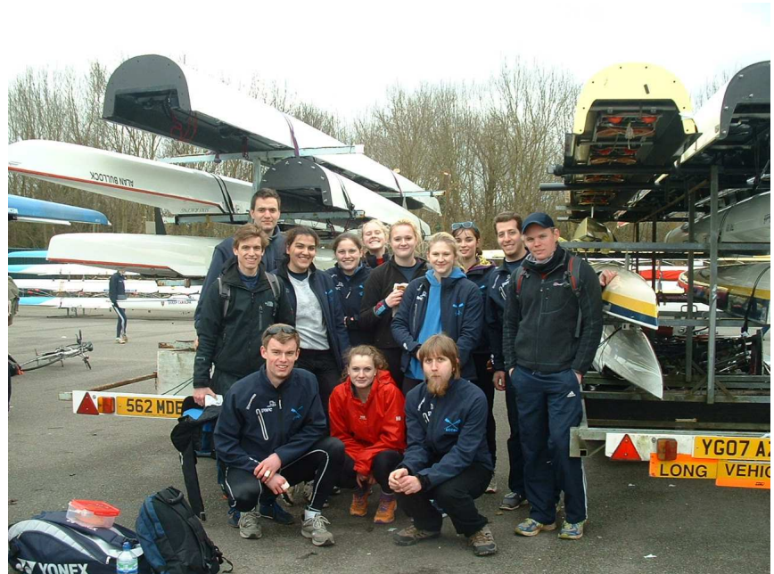
Catz rowers in the car park at Dorney Lake the weekend before Torpids, having loaded up the trailer after their only rowing of the term.

If we were really pushing the boat out, as it were, we treated ourselves to a tank session as well. W1 had relief from this (productive) monotony in the form of a trip to Dorney, where our technical work on the ergs definitely showed its worth.