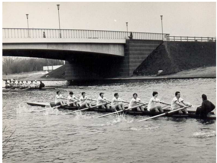
The 1965 1st Torpid, approaching the recently completed Donnington Bridge, racing on the 'County' station.

The 1960s and 1970s were a period of experimentation with the Torpids rules, notionally with the dual aims of allowing fast crews to progress upwards more rapidly while also encouraging crews to train to row the full course rather than for a sprint, lack of stamina being perceived as a weakness of Oxford oarsmen compared to their Cambridge counterparts who had the advantage of a longer stretch of river on which to conduct their bumps.