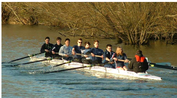
The Men's 2nd Torpid racing in today's IWL-D time trial.

The women have been struggling for numbers and can only muster a single crew this term. There may be a men's 3rd Torpid but I believe it has yet to take to the water and, if it does, will still have to qualify in Rowing On. Wednesday start times and positions for the fixed division St Catherine's boats are listed below.