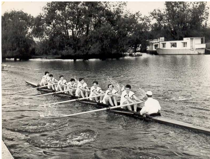
Vetera: The 1st Eight, approaching the Gut, in 1965.

71st 6:10 St Catz D (M2) 37th/38 M8 73rd 6:12 St Catz C (M2) 38th/38 M8 77th 6:18 St Catz A (W1) 29/32 W8