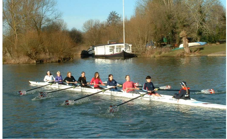
et Nova: The Women's Torpid, approaching the Gut, in today's IWL.

The women will be getting a new VIII, thanks to the generosity of a couple of alumni, but that won't appear until the start of next term so I'll save the details for the next newsletter.