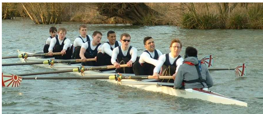
The Men's 1st Torpid, racing on the Friday.

successful recruitment drive — around three boats' worth have signed up. The lure of summer rowing is proving to be a strong incentive to pick up an oar. An exciting term awaits!