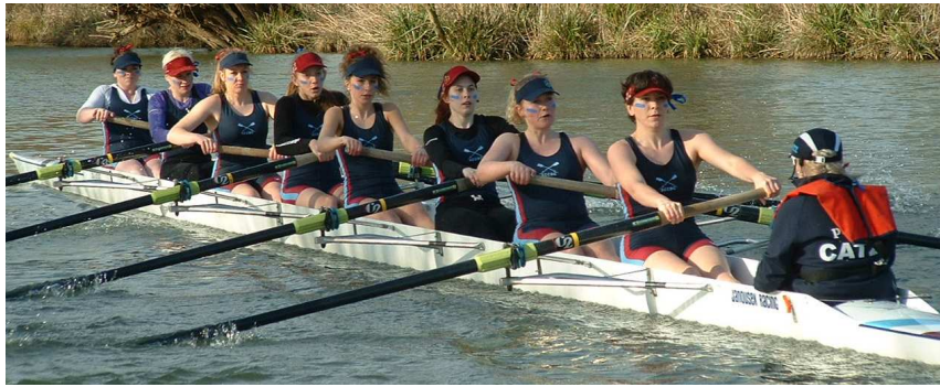
The Women's 1st Torpid, racing on the Friday.

Focus now is on Summer Eights, with plans for a training camp before the beginning of Trinity and a hefty novice recruitment programme, with aims to have at least three boats entered with varying levels of seriousness. Considering the huge improvements the 1st VIII have already made in such a short space of time, high hopes are to be had for the progress and performance of the women's boat club