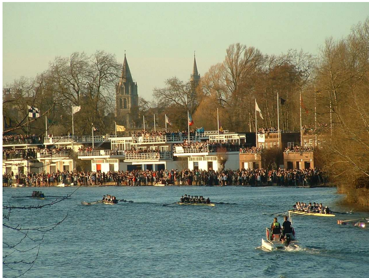
The (only) one that got away: St Catz Men's 1st Torpid, 2nd from left, pulling away from Worcester at the tail end of Div I on the Saturday.