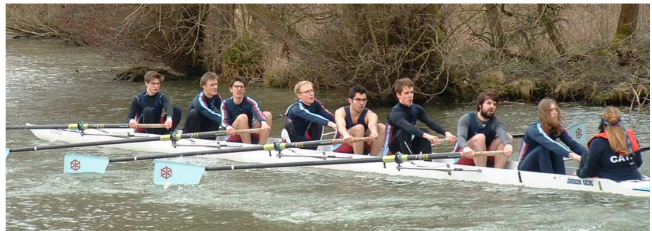
The Men's 2nd Torpid racing on the Thursday.