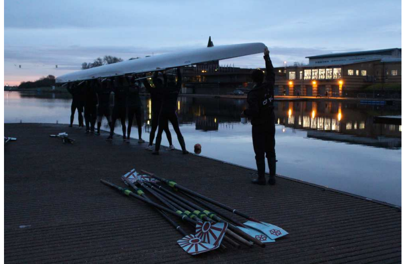
Dawn outing at the Holme Pierrepont training camp

For University triallists the January training camp means flying south in search of sunshine and warmth. For Catz, it meant Nottingham. Yay.