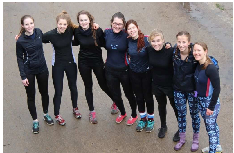
The women's 1st Torpid

As ever, the RS committee is hunting for fresh blood. The basic duties of an ordinary committee member are not onerous: attending the termly committee meetings