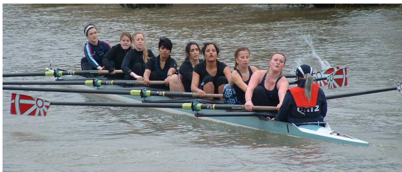
The Women's 2nd Torpid racing in IWL-C

Men's Div I races at 5 pm, Women's Div II at 3:30 pm, and the men's 2nd Torpid, starting 11th in Div IV, will be racing at 2 pm. There was no women's 2nd Torpid last year, so this year they'll have to qualify, along with any yet-to-materialise 3rd Torpids, in the Rowing On races, scheduled for Friday, 19th February.