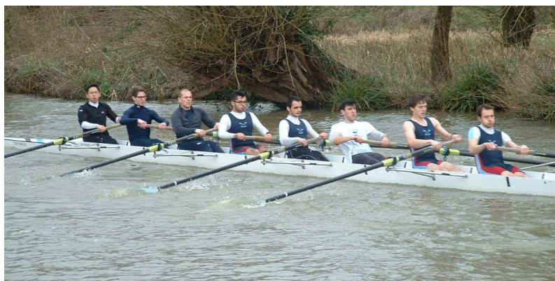
The Men's 2nd Torpid racing in IWL-C