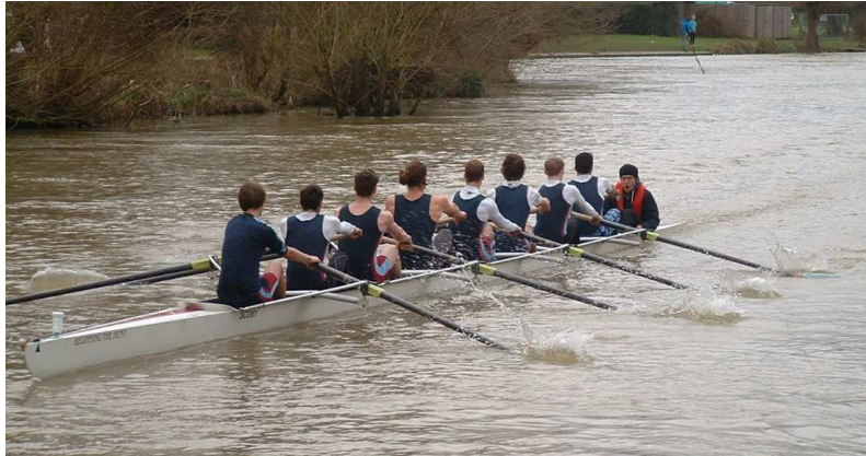
The Men's 1st Torpid racing in IWL-C

Men's Div I races at 5 pm, Women's Div II at 3:30 pm, and the men's 2nd Torpid, starting 11th in Div IV, will be racing at 2 pm. There was no women's 2nd Torpid last year, so this year they'll have to qualify, along with any yet-to-materialise 3rd Torpids, in the Rowing On races, scheduled for Friday, 19th February.