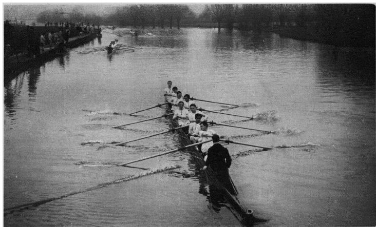
The 1913 St Catherine's Torpid at the start

Even so, Eights oarsmen apart, the eligibility criteria seemed to have remained rather loose, with recruits being brought in from far and wide, and sometimes even paid, to fill up the crews (2s 6d, or 12½ p, was the going rate in 1849, for the bow seat in the Exeter Torpid).