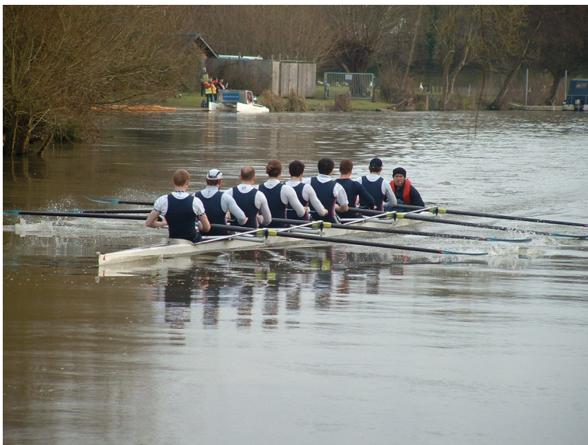
Catz Men's 1st Torpid racing earlier in today's IWL-D