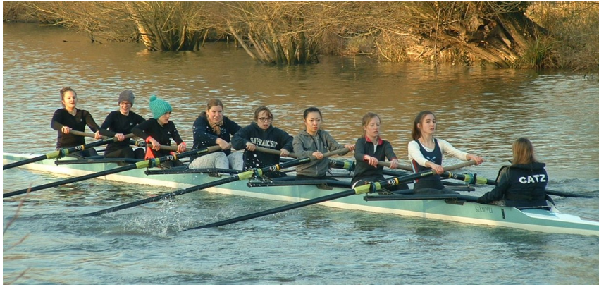
Catz women racing in IWL-C