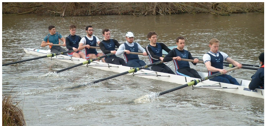
Catz Men's 2nd Torpid racing earlier in today's IWL-D

IWL-D was run today over a shortened course due to fast stream conditions (at Amber flag). There was no Catz women's entry but the men, complete with a new set of blades and rented boat (while theirs is being repaired), are getting back on track with the not-quite-final line-ups for the 1st and 2nd Torpids finishing 2nd and 18th respectively out of 27 men's VIIIs.