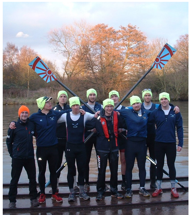
The Men's 1st Torpid

ever position on the river, the men are unanimous in that their main takeaway is to move even higher next term. Bring on Eights.