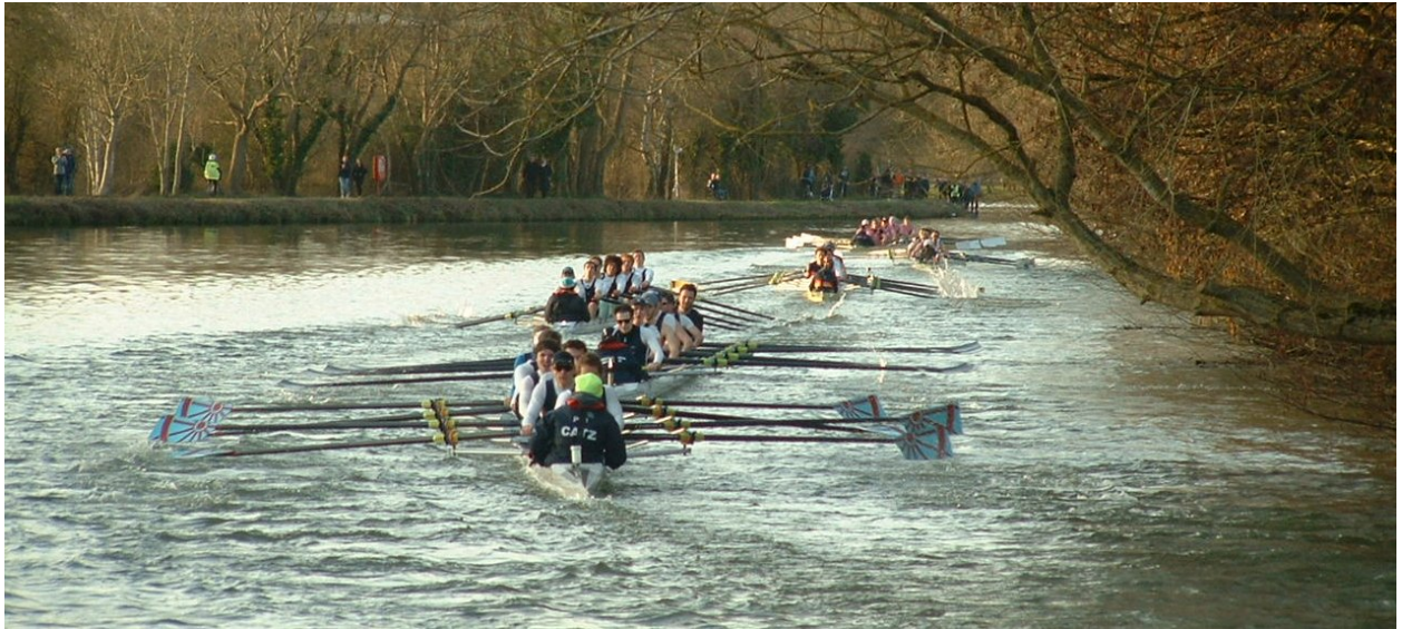
The top of Men's Div I on the Thursday with Catz closing on Christ Church