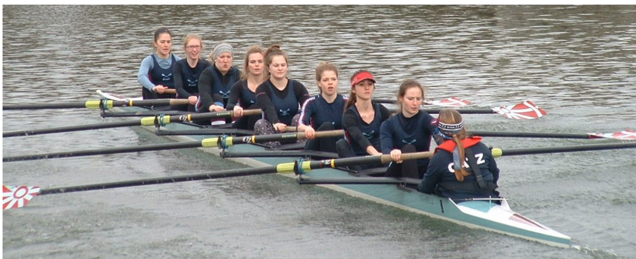
The women's Torpid racing on the Friday