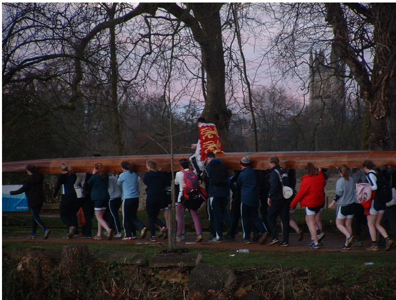
Bonfire of the Valkyries: this year it was Oriel women's turn to carry off an old wooden shell for burning to celebrate their Torpids Headship.

Finally a request from a Catz alumnus who seems to have discovered — unfortunately rather too late to be of any service to the Boat Club — a sudden desire to get in a boat and row rather further than seems really necessary.