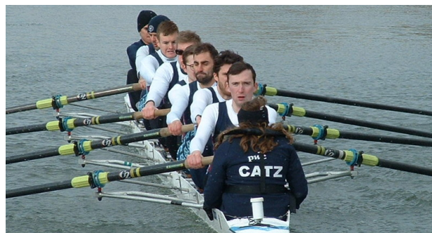
The men's 2nd Torpid racing on the Wednesday