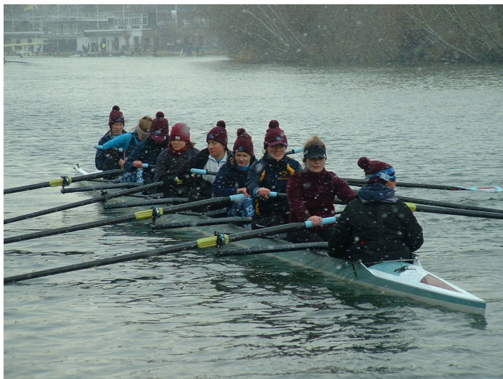
Generation Snowflake? the Women's 1st Torpid on the Wednesday. Yes, it is snowing, but not in a fluffy, warm sort of way.

The Tideway boat races are next Saturday (24th March) and this year Catz have a representative in the Women's Boat Race. In the last newsletter I reported that the Cambridge crews had been making all the early running but, looking over the performances since then, . . . well, you'll have to judge for yourselves. Tomorrow (18th March) it's the 'Henley' boat races, although now relocated to Dorney.