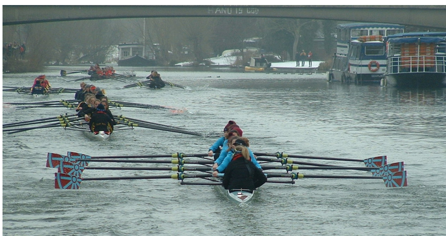
The women's 1st Torpid in pursuit of Brasenose on the Saturday