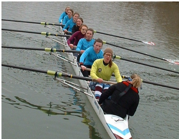
The women's 2nd Torpid starting on the Wednesday

All in all it's been a very triumphant term and we hope to carry our successes on into Summer Eights in Trinity!