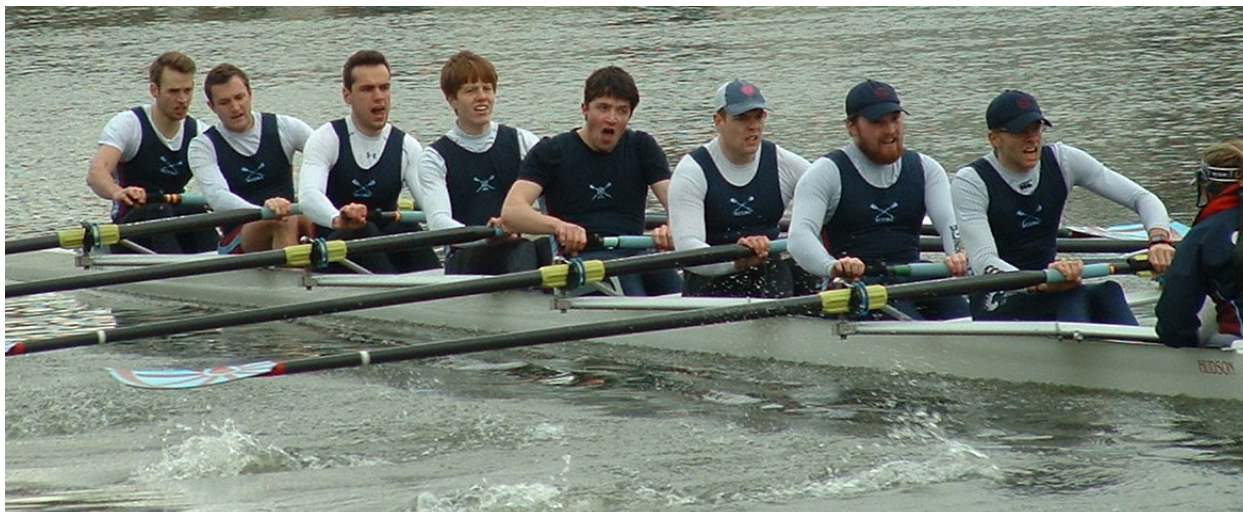
The men's 1st Torpid racing in IWL-E