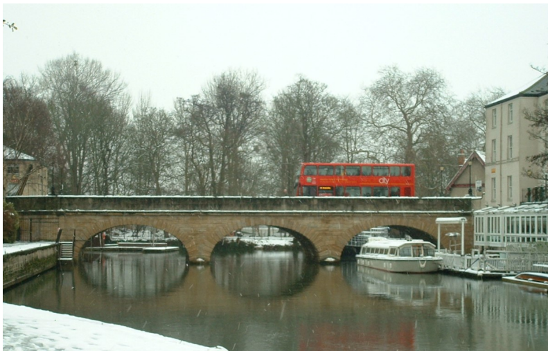
Folly Bridge, after yesterday's snowfall

For rowing it's been about as benign a January as can reasonably be hoped for (although February has just announced its arrival with a sudden dump of snow). The Boat Club hasn't wasted the opportunity and, one week into term, they had twice as many crews racing in the opening IWL as any other college. Torpids will be from 27th Feb – 2nd March, with the RS AGM and Dinner held, as usual, in College on the Saturday after the end of racing.