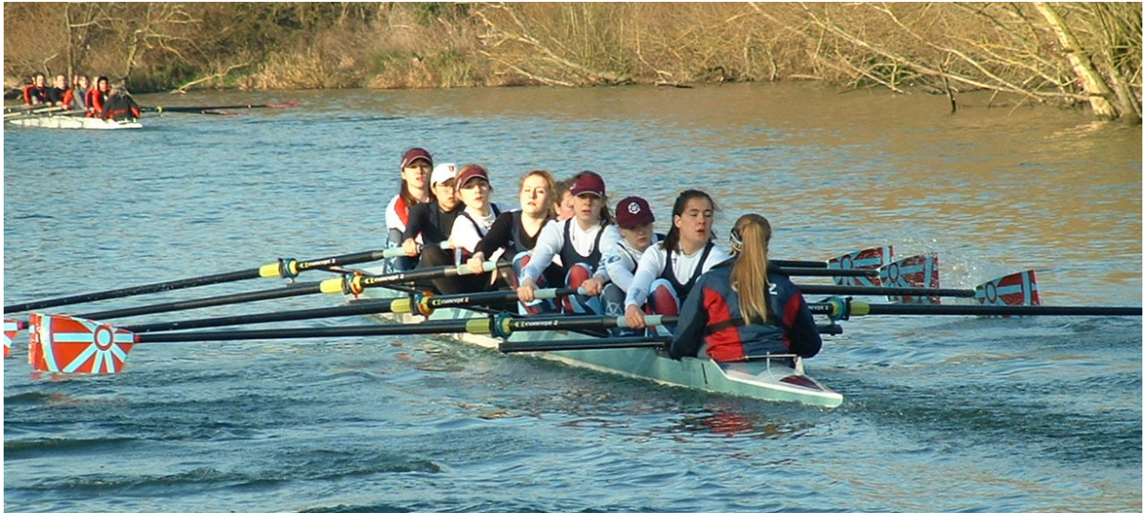
The women's 1st Torpid racing in IWL-C earlier this term

The weather was fine, but there was a strong wind, and the stream, which was only just inside the river banks, was running at a great pace and told heavily against the lighter crews. Some of the finishes were very close. The competition is on the American tournament system, and, after three eliminating rounds, the winners in both the contests will race on Thursday.