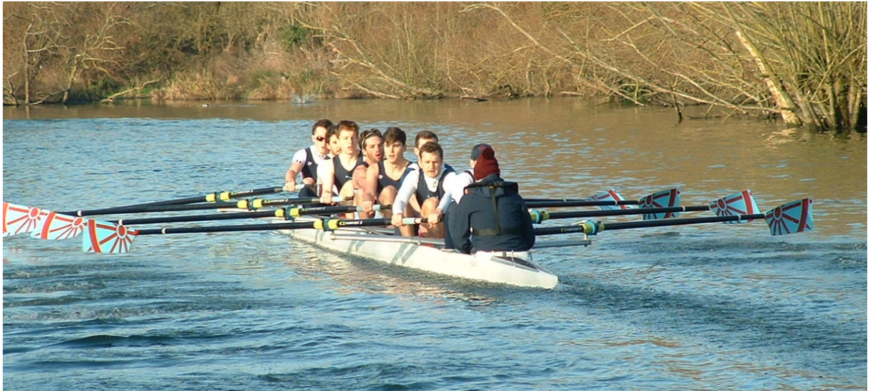
The men's 1st Torpid racing in IWL-C earlier this term