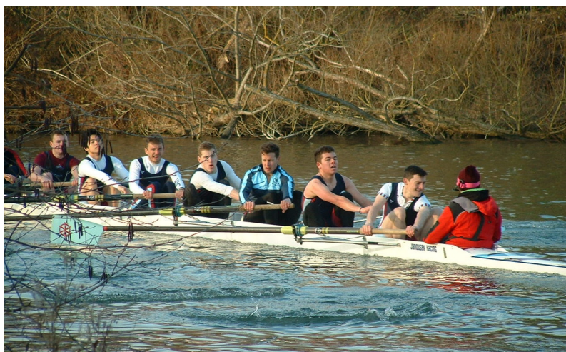
The men's 2nd Torpid racing in IWL-C earlier this term