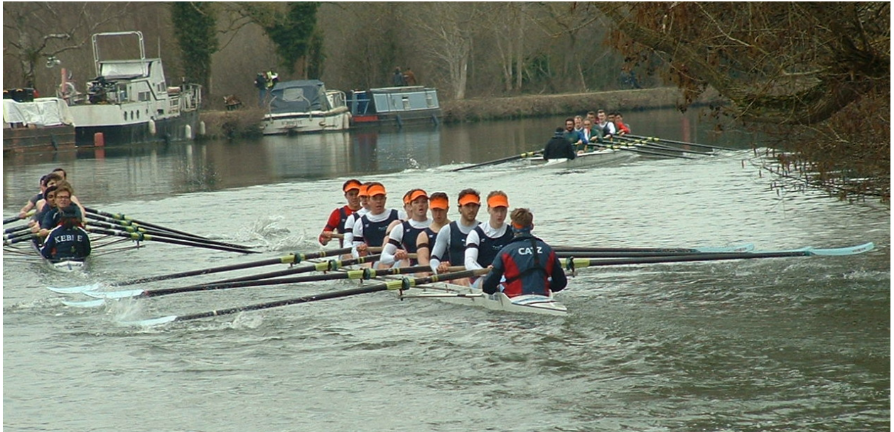
The Men's 2nd Torpid chasing down Keble II on the Friday