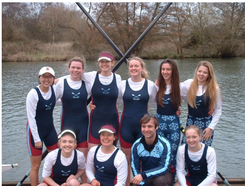
... No, apparently not. No worries at all.

Web: eodg.atm.ox.ac.uk/user/dudhia/rowing/rs.html