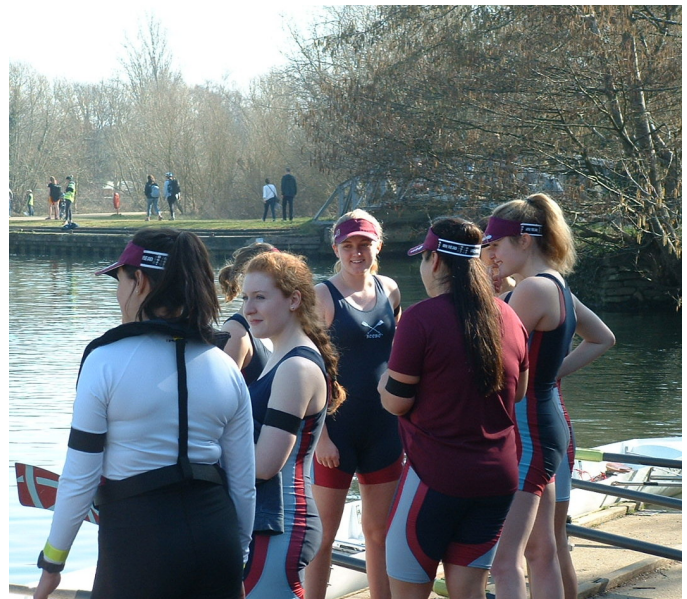
The Women's 2nd Torpid