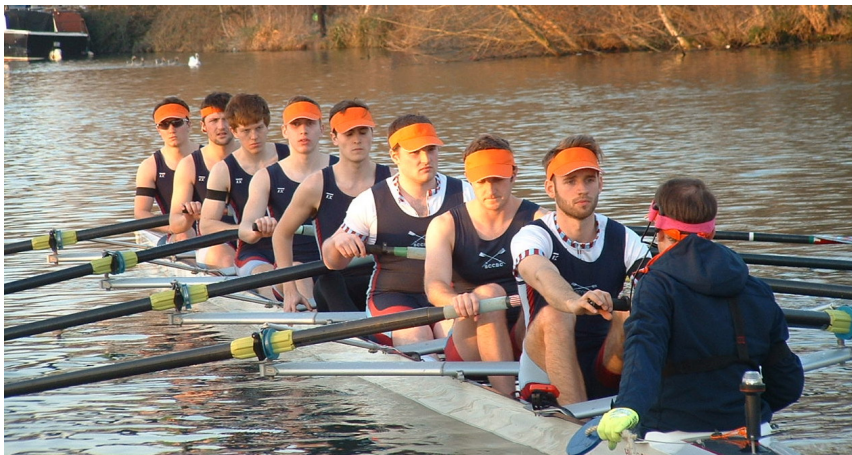
The Men's 1st Torpid

At Torpids, M1 finished plus one, bumping Christ Church to emerge 4th on the river (up from 5th) after 4 days of racing — this is the joint highest St Catherine's has been. M2 had a successful first three days, but after an unfortunate equipment incident on the final day of racing they finished only plus two, and now sit 4th in Division IV.