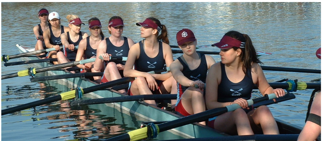
A tense moment as the women's 1st VIII prepare to start their Torpids campaign. Need they have worried . . . ?