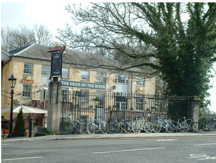
As the sprouting of leaves marks the return of spring, so the gathering of bicycles outside the Head of the River pub heralds the return of rowing on the Isis.

OUBC and CUBC tend to prefer private fixtures rather than open events, which at least maintains some uncertainty over the outcome on Boat Race day. This year, however, there was a mysterious 'Isis' crew in the Quintin Head. Given their relatively slow time, I was a bit worried, but it turns out OUBC are running a third VIII.