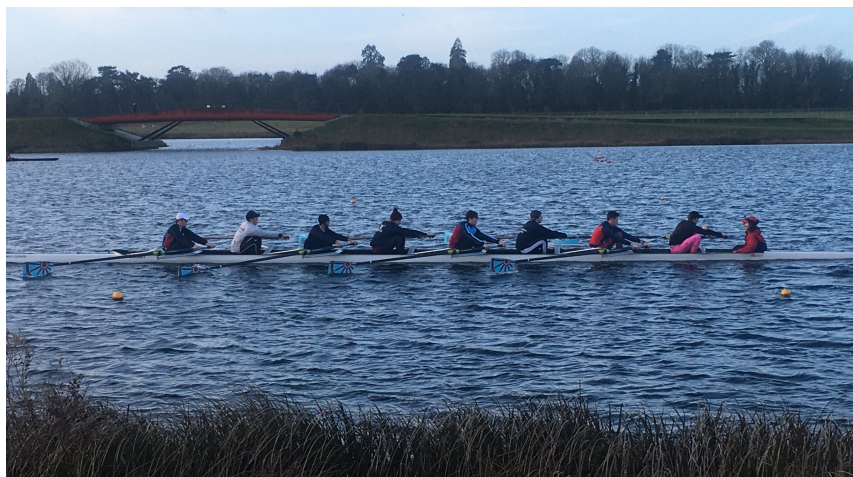
The Men's 1st Torpid training at Dorney Lake this morning.

There had been a couple of mishaps during the term. Phoenix had been damaged badly when she got caught up in a bash during a second VIII outing and the estimate for the repair was £87.50. Unfortunately the insurance policies were out of date as they had last been reviewed in 1959, and Phoenix was uninsured ... When Phoenix was repaired she should be renamed Trespassers W .