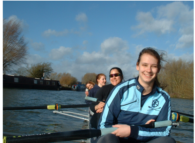
Catz senior women out in a four this afternoon

There is another option. Normally OURCs are the first to squash such ideas as impractical, but this year they themselves have proposed a contingency plan to move Torpids back to 8th week (11-13th March). I assume a decision will be reached at the next Captains' meeting.