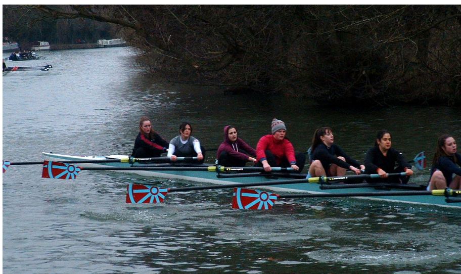
The Women's A crew racing in the gloom at the end of IWL-C