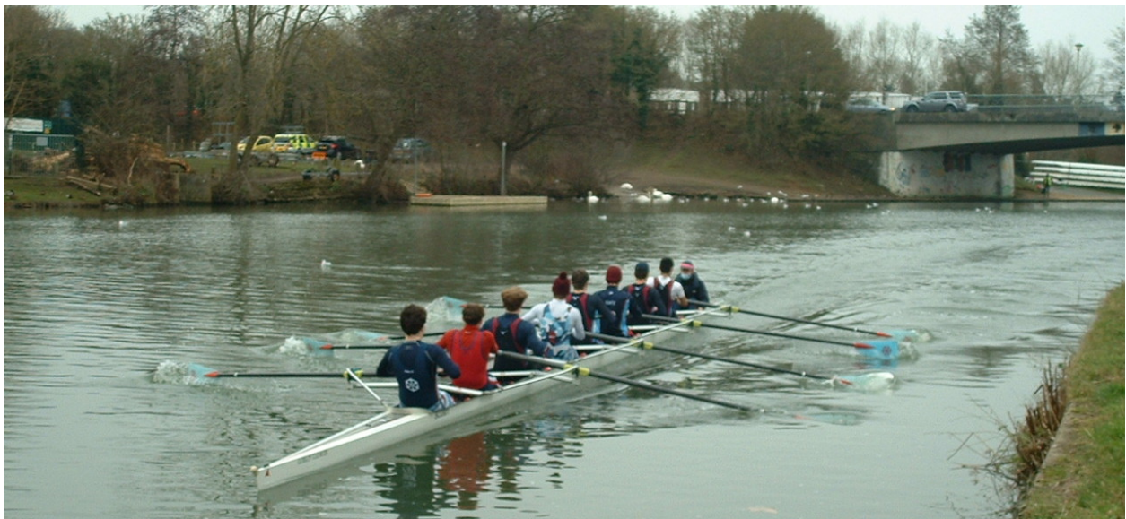
2022 Racing gets under way with the Catz men's A crew leading off the first division of IWL-C