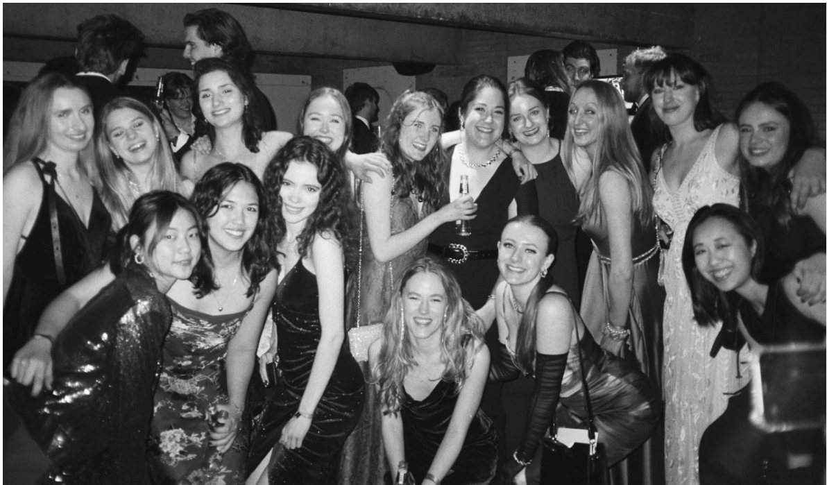
The Catz women's squad, approximately three hours after the end of Torpids