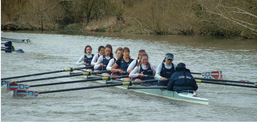
The Women's 1st Torpid racing on the Thursday

This term we also had the added challenge of training 20 new members. They managed to get racing experience alongside the senior members, placing in the middle of the pack in the IWLs and beating many college 'A' boats. Unfortunately, however, illness was still rife throughout the term, which also meant that our M3 narrowly missed out in