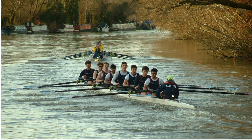
The hitherto unprecedented sight of a Catz men's crew chasing the Headship, here on the Friday (by which time it had stopped raining)