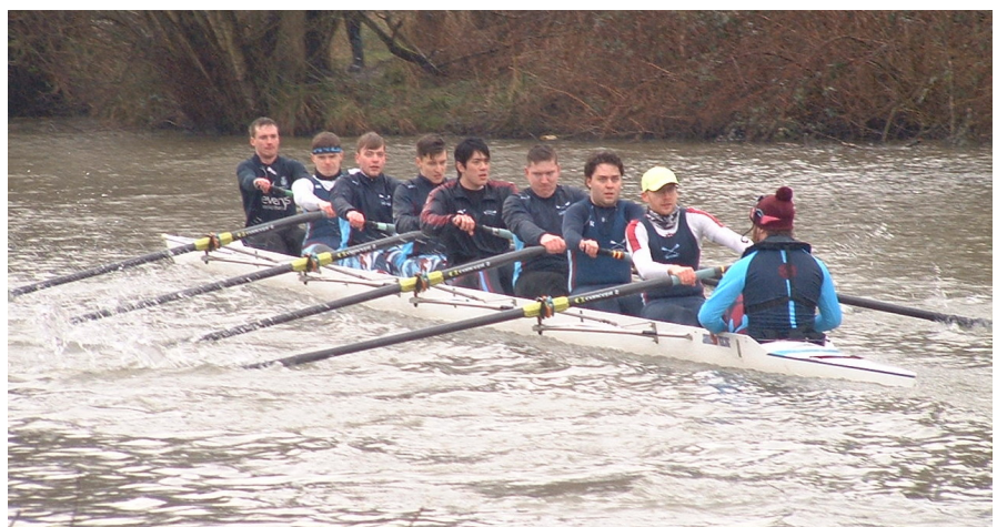
The men's 2nd Torpid racing, in the cold, cold rain, on the Wednesday (a mere 10 days before the start of the training camp in Italy)

Our sights don't end here though, with our eyes now being set on a successful Summer Eights campaign, for which we have already begun training with a week-long training camp in Italy.