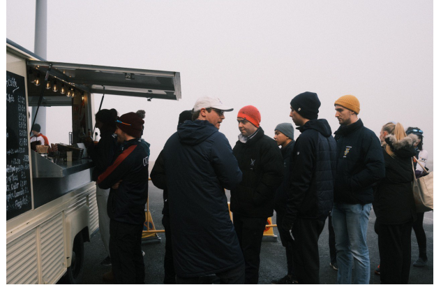
which meant there was only one thing for it.