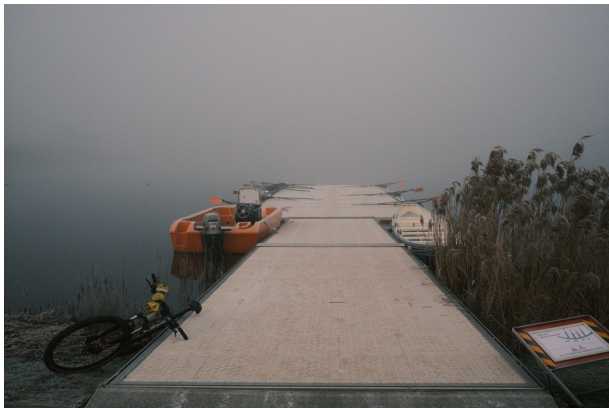
A disappointing view down the 2000m Dorney Lake course last weekend. Catz had hoped to escape the floods, only to find themselves thwarted by fog . . .

Torpids is a week earlier than usual (22–25th Feb), so most crews are going to be short of water time, and the cancellation of the last two IWL only adds to the general air of unpredictably. In that same spirit I'm afraid we've also left it rather late but we're still hoping to arrange the Rowing Society Dinner & AGM for the Saturday of Torpids, 25th February.