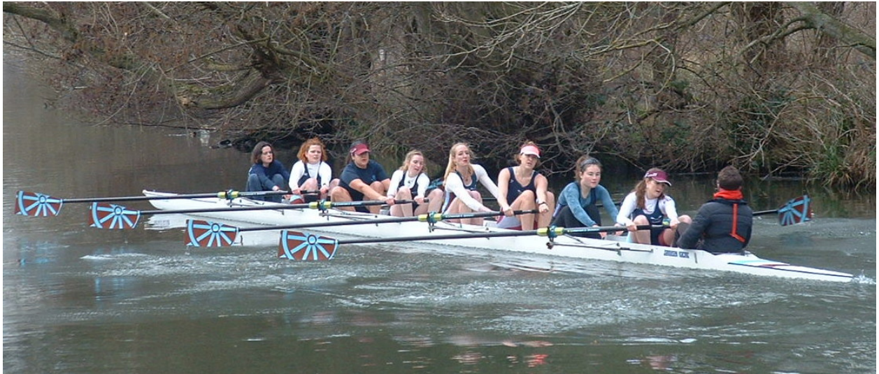
The Women's 1st Torpid on the Friday

However, we know that significant work will be required in order to achieve this. For this reason, the last few weeks of term involved tank sessions to improve technique, and a series of productive outings, including one in which we rowed through Iffley and Sandford locks. This lock trip was incredibly beneficial, so we aim to be able to repeat this early in Trinity term, in the hope that the extended time on the water gives each boat more chance to come together as a crew, something which we felt was lacking this Torpids.