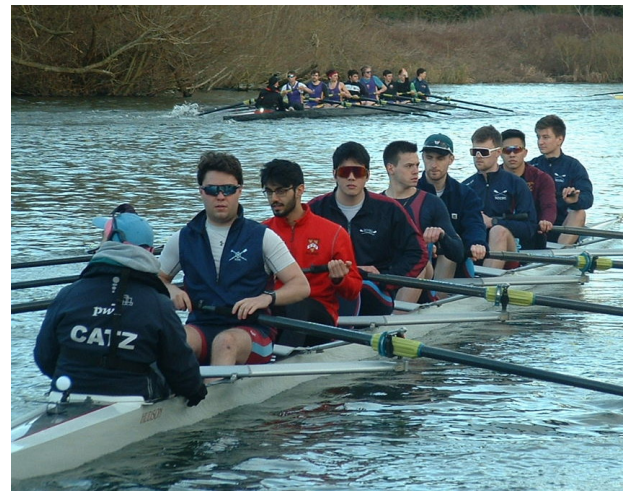
The Men's 1st Torpid on the Saturday

in and determination shown by every member of both crews, with our highlight of the week being an incredibly gutsy row-over on the Friday by M2, chased closely by New College II who had overlap for the last 200 metres or so. Nevertheless, a difficult week for SCCBC but there's a lot to learn, and with a very large proportion of the M1 likely to be around next year we're hopeful that we can rapidly regain the positions we lost.