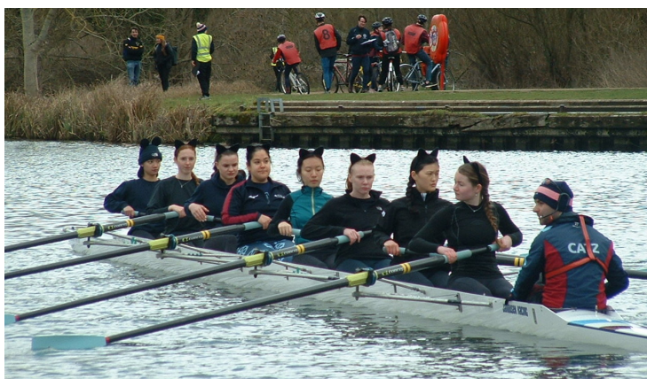
The Women's 2nd Torpid. Hang on ... is bow wearing 'mouse' ears?