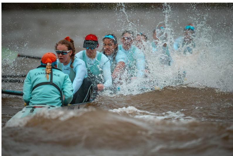
Having fun yet? One of the Cambridge women's Trial VIIIs shortly after the start. Photo by Benedict Tufnell (Row360).

When the Oxford crews turned up for their races two days later the wind had dropped, the skies had cleared and conditions were near perfect.