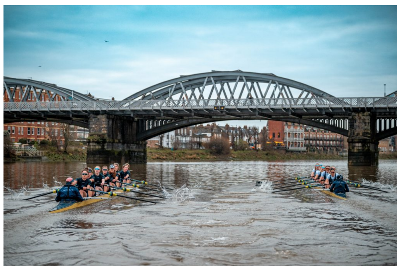
Two days later Oxford's women conclude their business in very different circumstances. Photo by Benedict Tufnell (Row360).

No sign as yet of the Oxford men's crews, whose first fixtures are still a couple of weeks away. The probable Blue Boat will be racing Leander on 25th February (this will be Live Streamed — details on the Boat Race web-site).