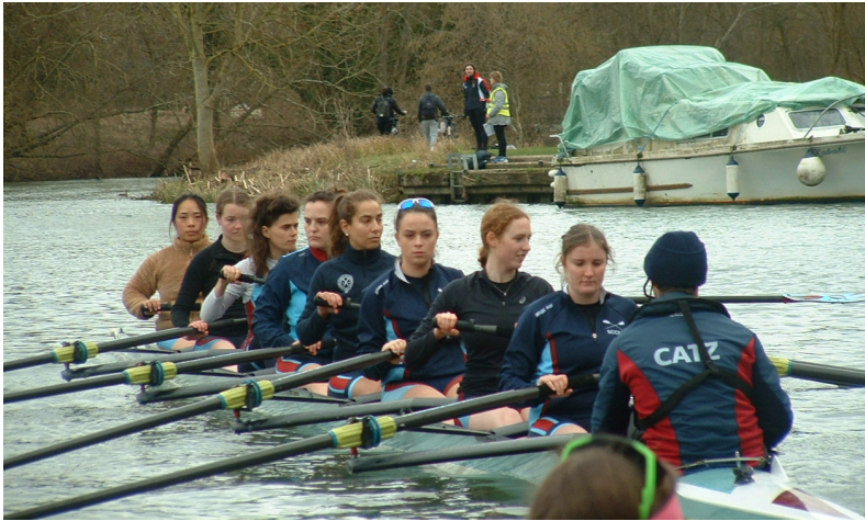
Catz women getting down to business, boating for the IWL last weekend