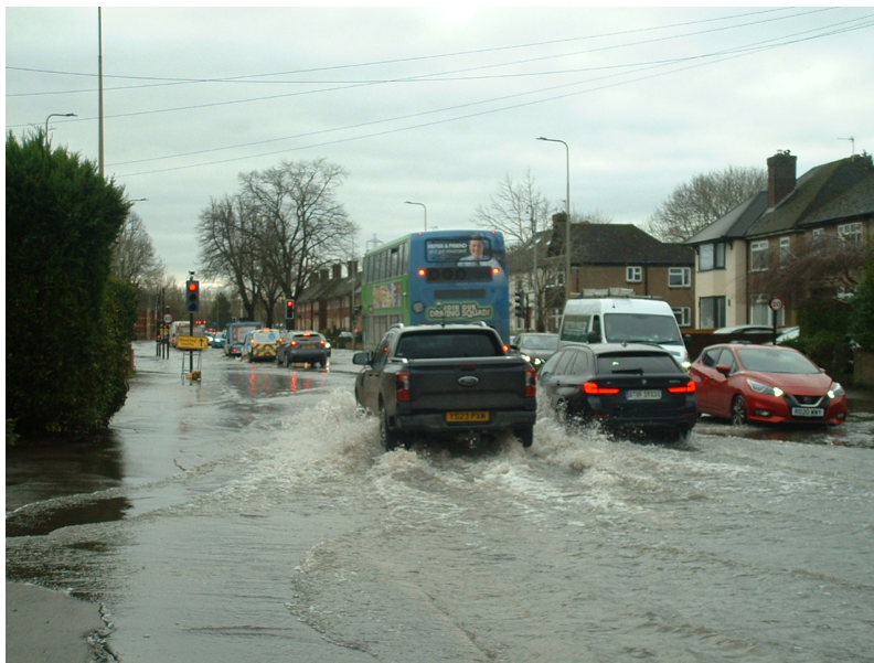
Looking south along the Abingdon Rd at the junction with Donnington Bridge Rd on 5th January this year, shortly before the road was closed.

While the locals may be feeling deprived of water time, spare a thought for our boatman whose extended outing has now entered its third month.