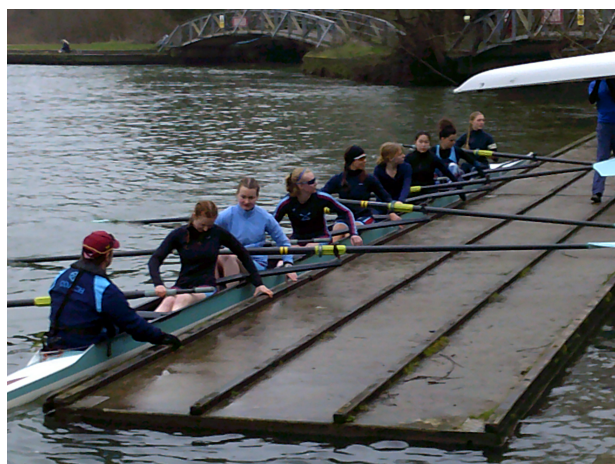
The Women's 1st VIII about to push off to race in IWL-D this afternoon.

Finally, and with a sharp intake of breath, the prospects for Torpids.