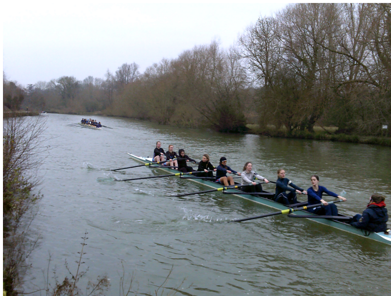
The Women’s 2nd Torpid racing in today’s IWL, in pursuit of, and eventually overtaking, Wolfson B.

Catz bumps have indeed been few and far between of late; just two in the last two years (one from W2 in Torpids 2023 and one from M2 in Eights 2023).