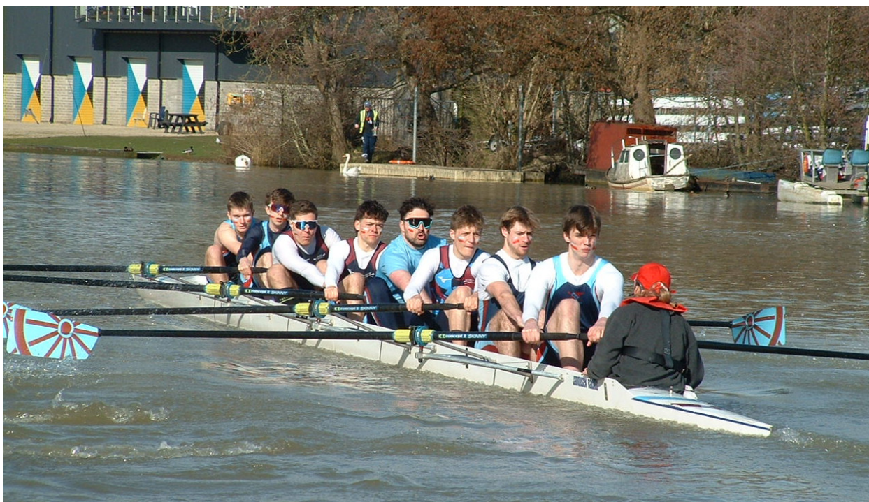
The Men's 1st Torpid on the Saturday