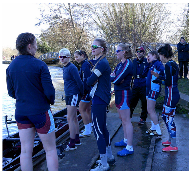
The Women's 1st Torpid waiting to boat on the Thursday.