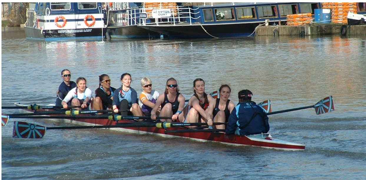
The Women's 1st Torpid on the Saturday