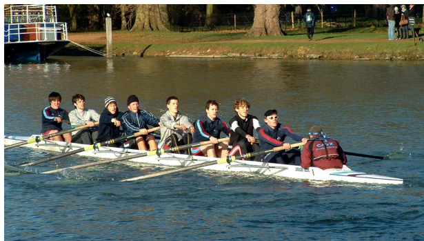
The Catz Senior Men's VIII racing in Nephthys Regatta.

League where, according to OURCs timing 1 , one of our IVs was the second fastest vessel on the water, a close 5 seconds behind Teddy Halls 1st VIII!