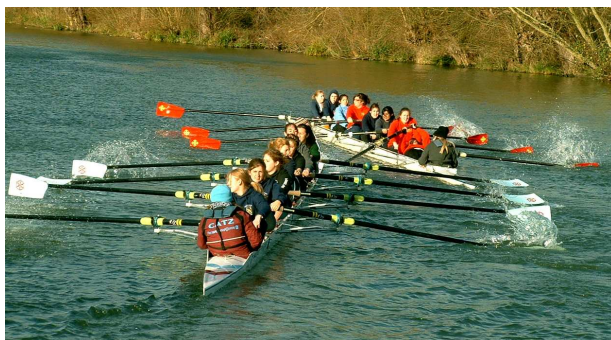
The Catz Women's Novice VIII getting in some early bumping practice in Nephthys Regatta. Unfortunately, it was supposed to be a side-by-side race.