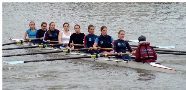
The Catz Senior Women's VIII racing in the Isis Winter League A.

The senior women have had two crews training this term, one competitively and one not. W1 were very fortunate to have five girls returning from last year's first boat as well as some keen and committed new members. We trained hard on and off the water from the very beginning and entered both IWLs and the