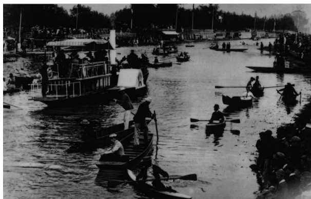
A contemporary postcard showing the Isis in 1889, looking downstream from the Head.

Torpids and Eights were raced over 6 days, from the Thursday through to the following Wednesday, with Sunday off (so Eights Week really was a week). Bumps rules were the same as for the current Eights, i.e. both crews dropping out when a bump occurred, but Eights was restricted to just the top boat from each of the 22 participating Boat Clubs so Torpids, with 27 crews including 2nd boats, was actually the larger event.