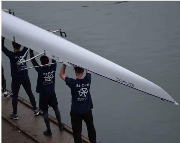
Catz Men's Novice B boating for Christ Church Regatta.