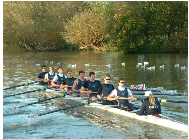
Catz men's senior squad racing in IWL-A