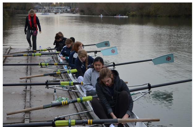
Catz Women's Novice B boating for Christ Church.

crews for Christ Church with both of them reaching the third day of the regatta. The novices impressed us all with their commitment and enthusiasm at this early stage, and with all those who have decided to join the senior programme we now have a squad more than doubled in size. We're looking forward to the gains that our vacation training will bring, for old and new seniors alike, and excited to see the impact that the crews we form will make this coming term, both on and off the Isis!